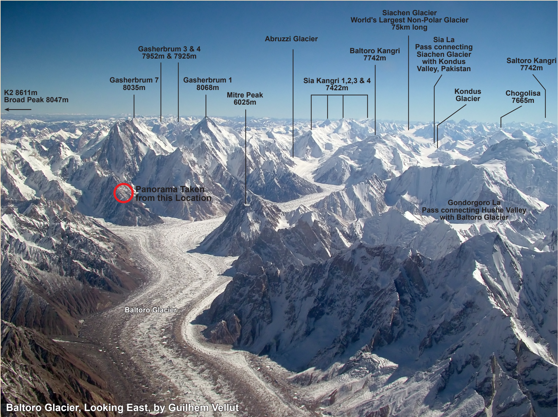
Baltoro Glacier, Looking East, by Guilhem Vellut