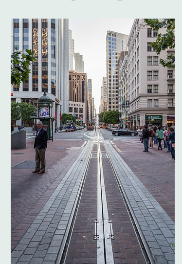
San Francisco in 2012

What differences do you notice? What similarities?