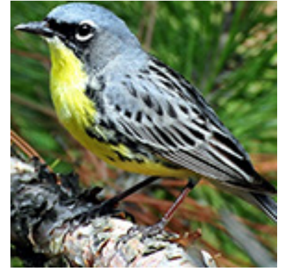
Jack Pine Forest

Screech owls hunt at night, watching for insects and mice to eat from high up in trees. Can you fly quietly through the night like an owl?