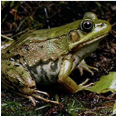
Marsh & Bog Wetland

Unlike many birds, the Kirtland's warbler builds its nest on the ground, under the lowest branches of the jack pine tree. Crouch down like you're sitting in the warbler's nest.