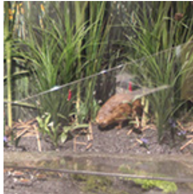
Marsh & Bog Wetland

Like many amphibians, green frogs live the first part of their life in the water and then live on land as adults. Listen carefully for the green frog's croak. Can you make that sound?