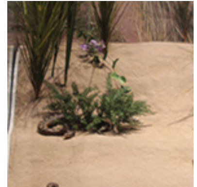
Great Lakes Coastal Dunes

Smallmouth bass lay eggs that look and feel like little balls of jelly on the rocks on the bottom of rivers. Can you swim like a bass?