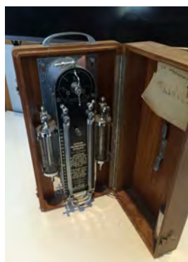
A mid 20th-century pneumothorax device, designed to deflate lungs in order to treat diseases like tuberculosis. Presented by Joel Howell.

Perhaps the most compelling feature of the Matter(s) of STS involved less 'talk' and more 'stuff.' Material things found equal footing with more discursive affairs, allowing participants to engage concurrently and critically with both types of matters. From Hello-Kitty cell phones to toy cars, and from curtains of northwest Madagascar to cement blocks and digital recorders, materials were 'black boxed' for conference participants to observe, listen to, and touch. Participants made conjectures about the design and use of each item, and at the end of the event contributors revealed the identities and potential significance of the mysterious objects.