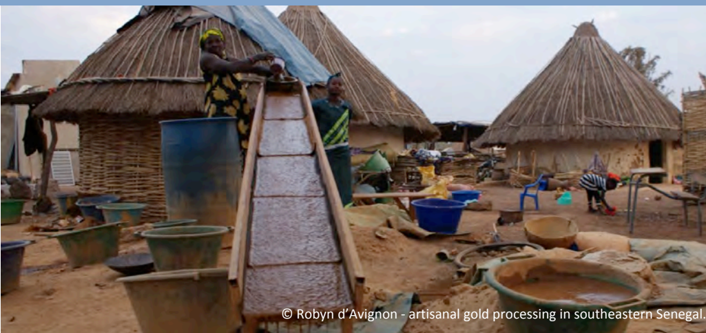
artisanal gold processing in southeastern Senegal.

Program in Science, Technology, & Society University of Michigan