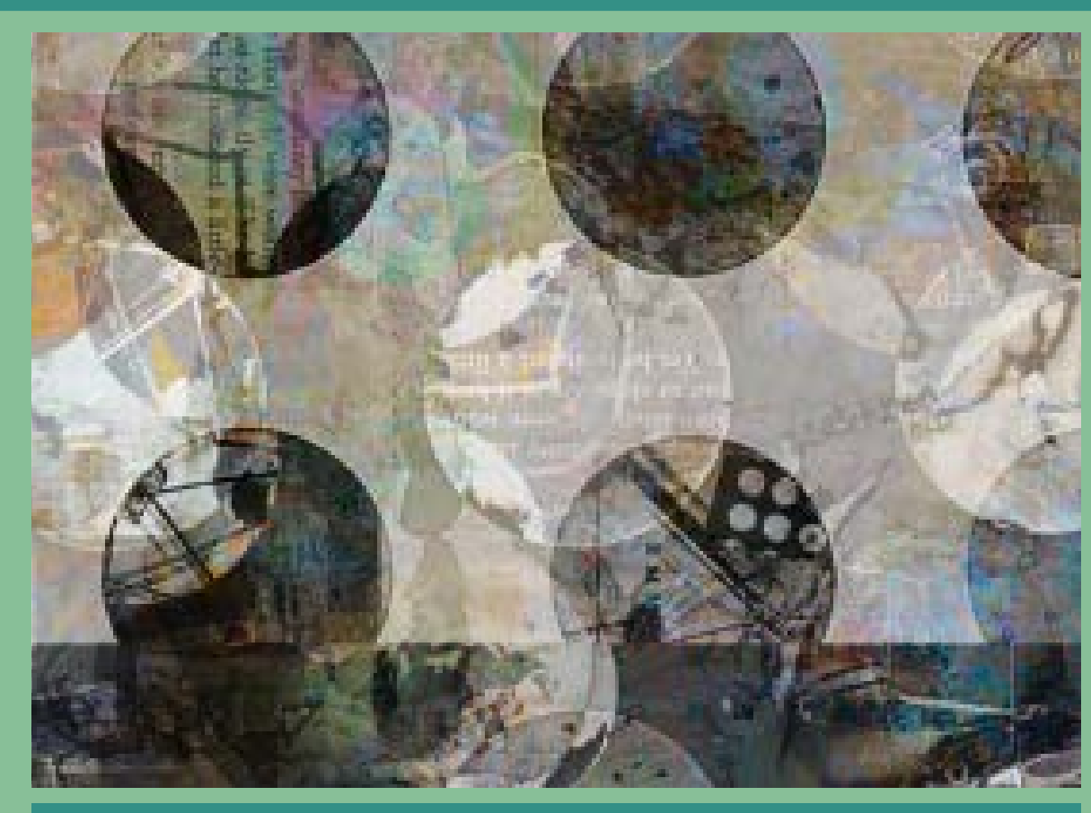
Dimensions cachées, réalités dévoilées Hidden dimensions, realities revealed

We are living through a time when the realities that shape the contours of culture and society have slipped out of place; systems that determine the patterns of our lives have abruptly become impermanent, if not obsolete.