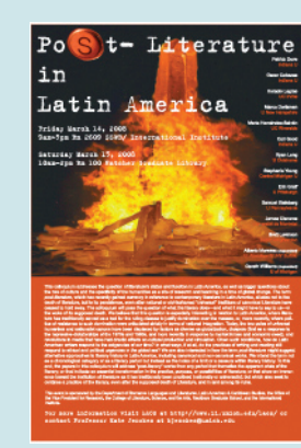
Poster from the colloquium

two primary poles of traditional conceptions of politics, the subject and the nation, (post)-literature gets at the very heart of