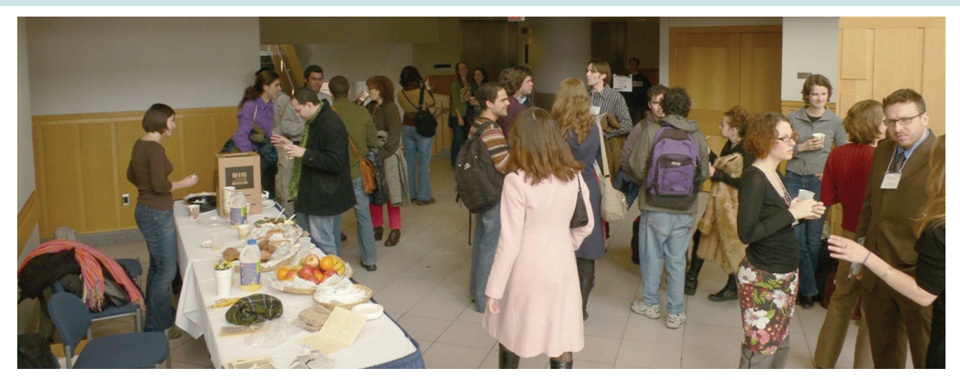
Students, faculty, and guests gather before the conference presentations begin