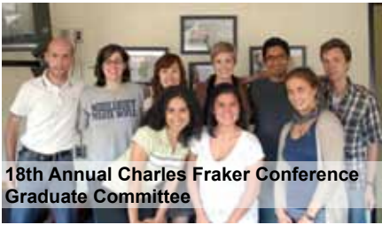
18th Annual Charles Fraker Conference Graduate Committee