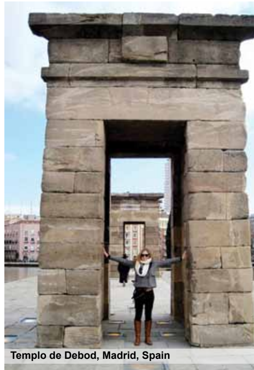
Templo de Debod, Madrid, Spain

In addition to my study abroad program classes, I took two classes at the Universidad Complutense de Madrid. The classes were taught in Spanish and I was expected to speak and write entirely in Spanish. It took me some time to get up the nerve to comment in a classroom full of Spaniards. When I finally did, it served to polish my