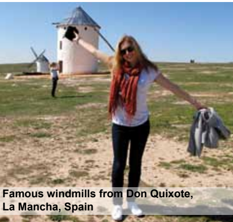
Famous windmills from Don Quixote, La Mancha, Spain