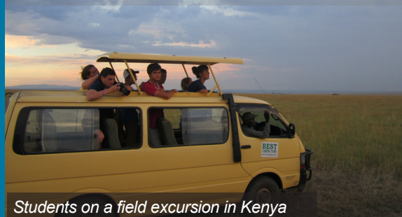
Students on a field excursion in Kenya

“PitE is being in the unknown. It is exploring something new, listening to someone, and walking that line just outside of your comfort zone.”