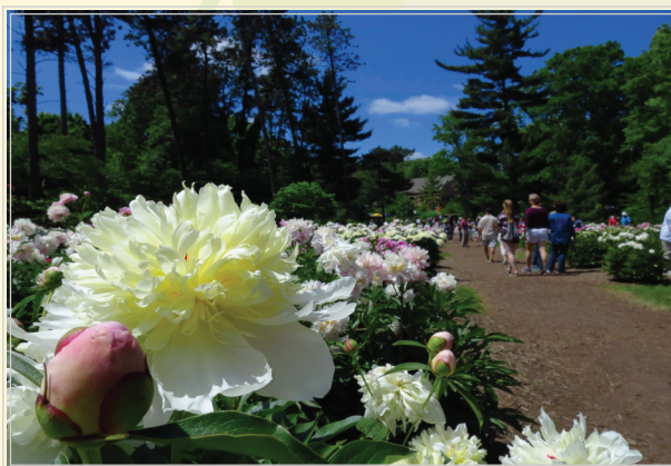
The Peony Garden, Nichols Arboretum