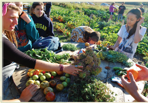
Campus Farm, Matthaei Botanical Gardens