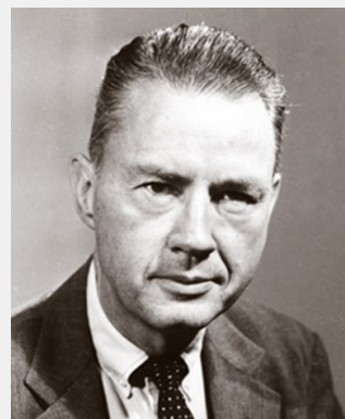
William K. Frankena