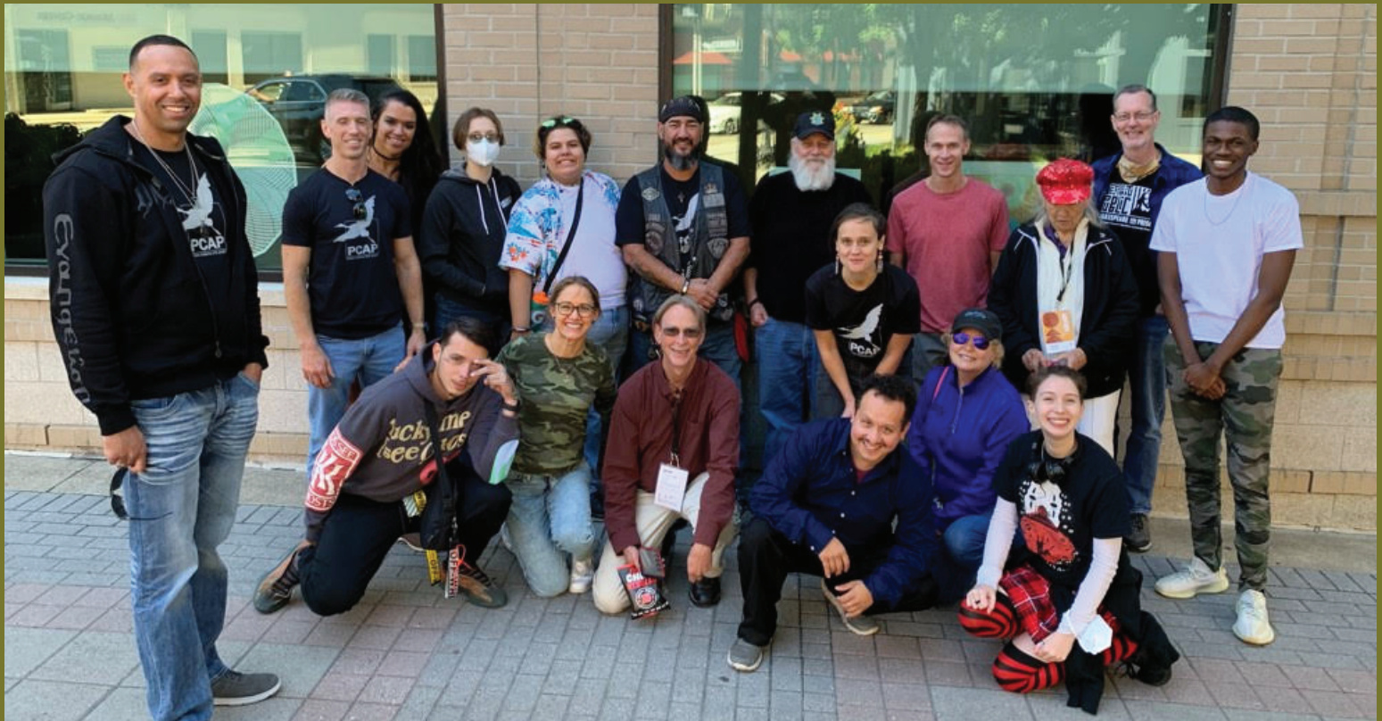
Linkage Community at ArtPrize, October 2022.

As always, write to us if you have any questions or concerns. The PCAP team is happy to help.