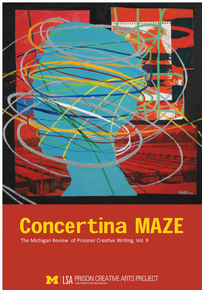
Volume 9 cover art by Scary