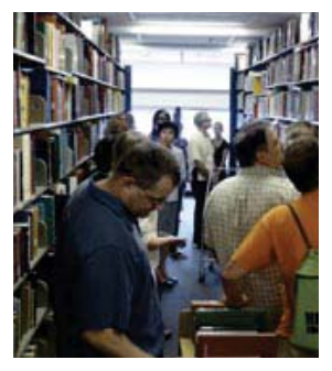
The Korean Studies collection has increased in size by 215% since 2003.

The Korean Studies collection has received generous funding support from the library administration despite the financial crisis in Michigan and the U.S.