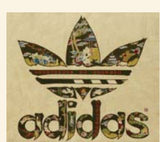
Son's Munjado series includes the depictions of the logos of the two athletic shoe giants Nike and Adidas.

Much venerated as an artistic tradition, ink painting accounts for a sizable proportion of artistic production in East and Southeast Asia. Yet few critics, curators, and institutions actively regard it as contemporary art, a telling reminder of the extent to which the contemporary art field remains beholden to certain definitions of the new and noteworthy.