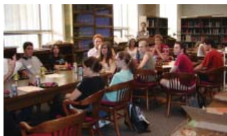
Reception for current and prospective Modern Greek students