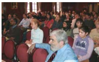
4th Annual Platsis Symposium on the Greek Legacy