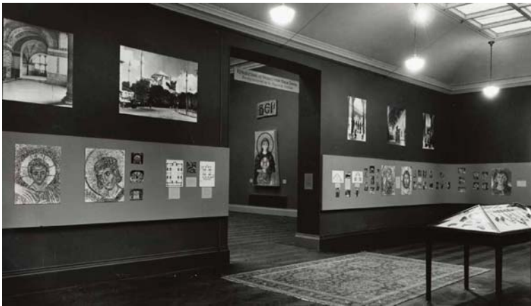
View into exhibition gallery at the Metropolitan Museum of Art.