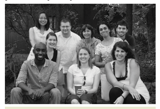
The Maddock Lab

In pursuing these studies, the Maddock lab recently discovered that, contrary to the textbooks, not all ribosomes are identical. Most proteins are synthesized from one type of ribosome, but some proteins require specialized ribosomes. This finding underscores the