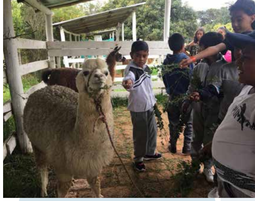
Students from TQP's 2018 Summer Program pictured at a local farm and petting zoo on a field trip

award amount and specific deadlines or criteria the students must meet. TQP doesn't partner with CGIS (Center for Global and Intercultural Study) or GIEU (Global Intercultural Experience for Undergraduates), two U-M departments that provide ample resources for specifically designed education-based travel programs. As a result, students looking to participate in TQP must seek scholarship opportunities outside of these two large funding programs. In addition to this, many of the remaining study-abroad scholarships require specific program durations, and class credit equivalencies, both of which TQP has trouble fulfilling as a service project. However, TQP board members have done substantial work to provide their tutors with a number of available scholarships that can be capitalized on for individual program funding. They understand that it can be difficult to find scholarships that are applicable to a volunteering experience and this has proven extremely rewarding in reducing angst and stress in tutors anticipating their travel abroad.