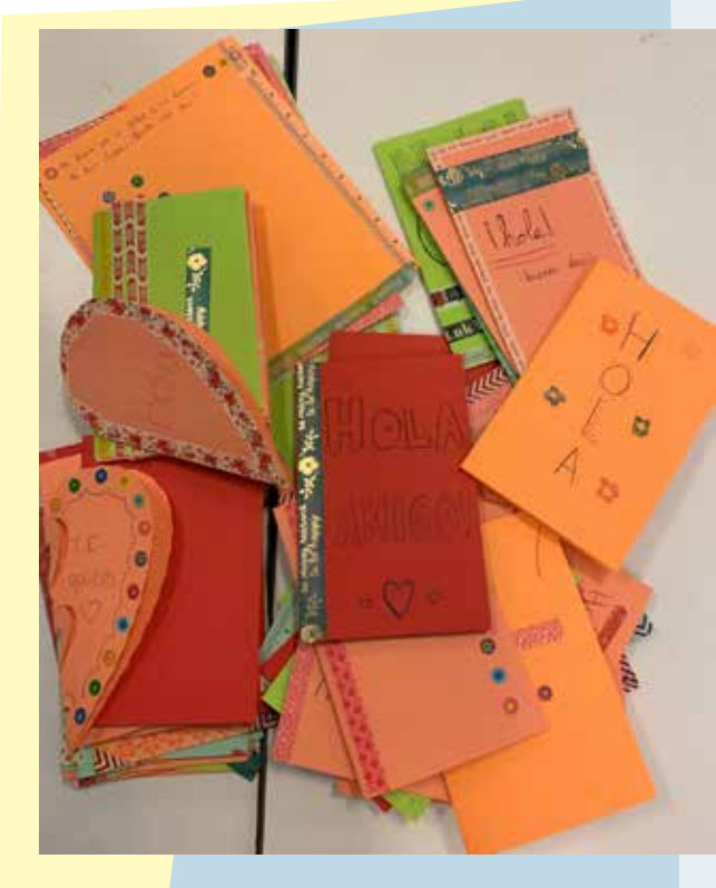
Letters written for students in TQP Summer Program in Quito for the summer of 2019

We have focused more on creating awareness here in Ann Arbor that Spanish is not the native or the only official language of Ecuador and many other countries in Latin America. We talk to the students about Quechua and other indigenous languages and people since many of them are unaware that these indigenous populations exist in the first place.