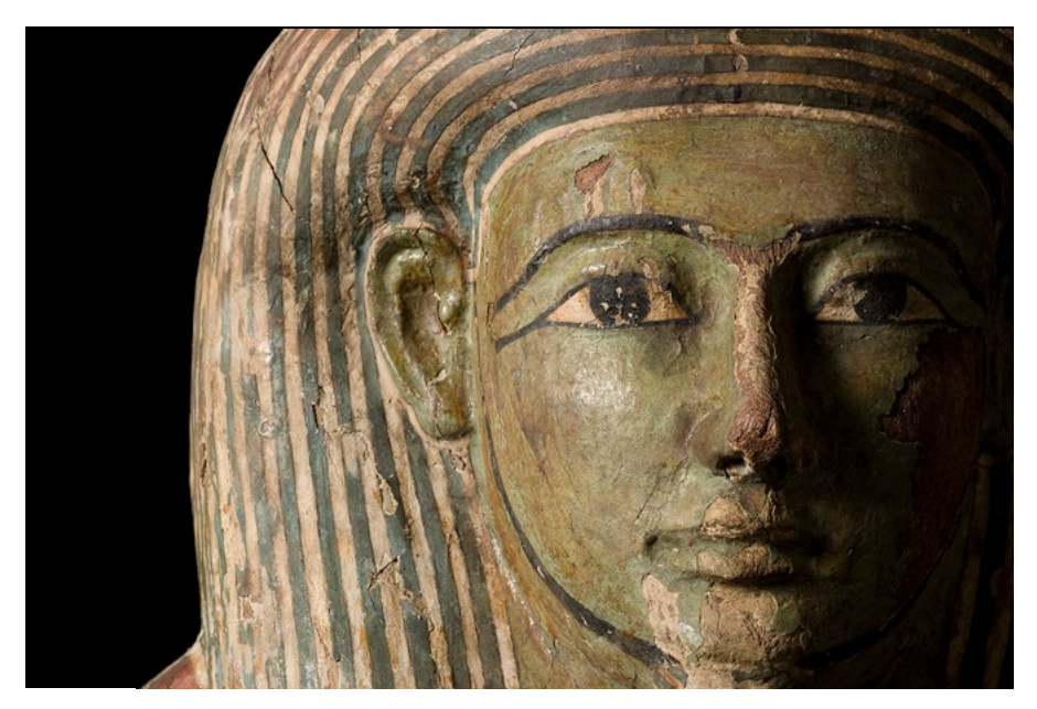
Figure 2. Coffin of Djehutymose: exterior of lid (KM 1989.3.1).

KM: What photographers and artists inspire you? What aspects of their work