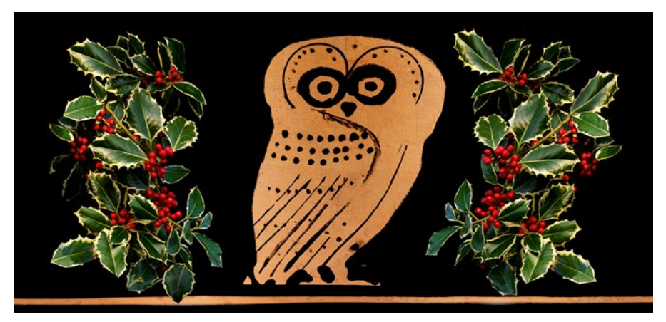
Figure 3. The owl flanked by holly sprigs on the 2017 holiday mailer. Art by Lorene Sterner.

In the Classical world, the little owl is prominently associated with wisdom and knowledge, being the symbol of the Greek goddess Athena and the Roman goddess Minerva. Probably the best-known representations of the little owl from antiquity are from its appearance on Athenian silver tetradrachms of the fifth century BCE. This coin, with its representation of Athena on the obverse and her owl on the reverse, is one of the most famous coin types of the ancient world, of which the Kelsey has a number of examples (fig. 5). The precise reason