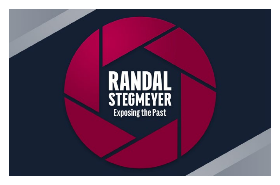
Our current special exhibition, Randal Stegmeyer: Exposing the Past , is available to view online at exhibitions.kelsey.lsa.umich.edu/randal-stegmeyer.

On March 10 and 11, Curator of Hellenistic and Roman Collections Elaine Gazda gave a workshop, Women of the Villa of the Mysteries: Social Contexts of the Bacchic Murals in Room 5 and Beyond, at the Dallas Museum of Art and conducted a seminar on Roman villas at the Edith