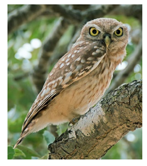
Figure 4. Little owl.

Terry G. Wilfong is the director of the Kelsey Museum and its curator of Graeco-Roman Egyptian Collections.