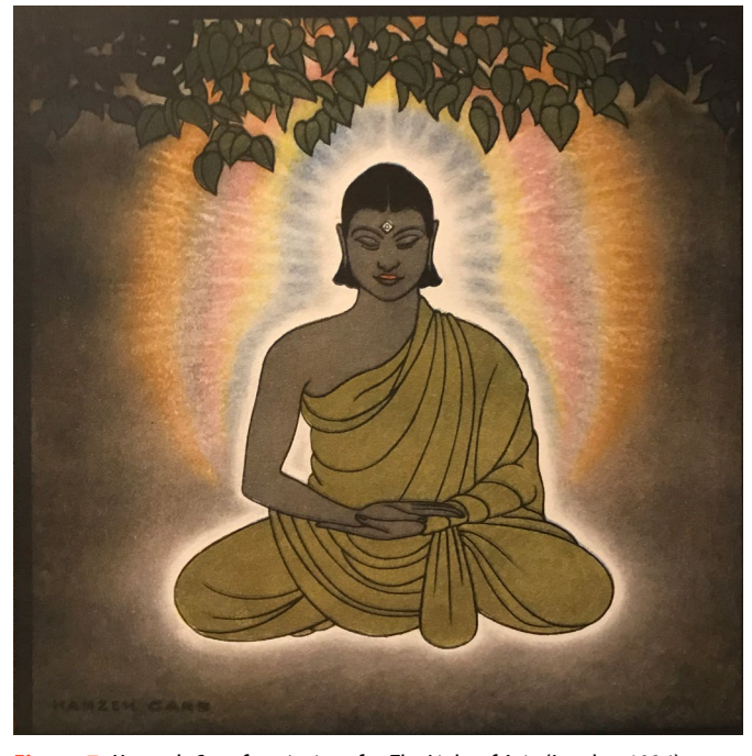
Figure 7. Hamzeh Carr, frontispiece for The Light of Asia (London 1926).