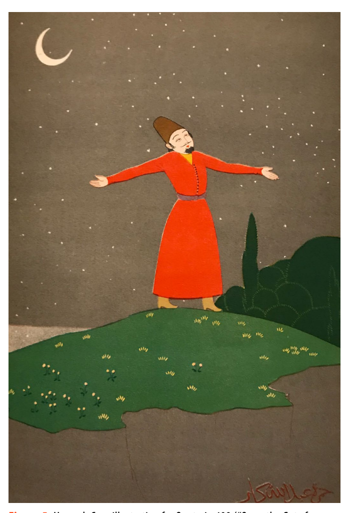
Figure 5. Hamzeh Carr, illustration for Quatrain 409 ("Open the Gate for me, for Thou alone canst open...."), from The Rubáiyát of 'Umar Khaiyám (London 1924).

The Rubáiyát of 'Umar Khaiyám, Translated from the French of J.B. Nicolas by Frederic Baron Corvo, with Sixteen Illustrations in Colour by Hamzeh Carr was published by John Lane The Bodley Head in November 1924. Carr's illustrations, reproduced by lithography from original paintings, appear at appropriate points throughout the text, depicting scenes suggested by the poems (fig. 5). In style, Carr's illustrations are clearly inspired by classic Persian miniature paintings, but Carr's images are considerably simpler and more austere than their Persian forebears. Each of his illustrations is signed in Arabic, Hamzah Abdullah Qar, the first names likely adopted by Carr in the wake of his earlier conversion to Islam. The handsomely bound quarto volume was priced at £1 1s., which would