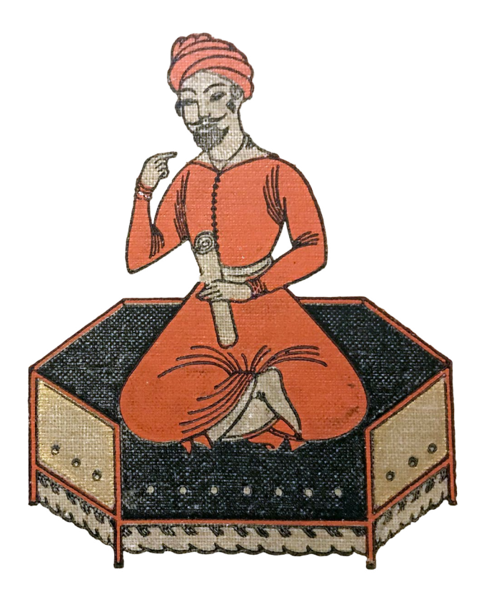
Figure 4. Hamzeh Carr, drawing of Omar Khayyam, from front cover of The Rubáiyát of 'Umar Khaiyám (London 1924).

The first of these books is a translation of the Rubaiyat of Omar Khayyam, a collection of poems by the Persian author who lived between 1048 and 1141 (fig. 4). Omar Khayyam became wildly popular in the English-speaking world in the 19th century thanks to an accessible and endlessly quotable translation by Edward Fitzgerald ("A Book of Verses underneath the Bough / A Jug of Wine, a Loaf of Bread—and Thou"). Fitzgerald's version, however, was often criticized for being incomplete and too "free." Publisher John Lane saw a need for a more accurate translation, and commissioned one from the eccentric writer Frederick Rolfe, who sometimes styled himself "Baron Corvo." Rolfe, in fact, did not know Persian, and his "translation" was based on an earlier French version. Rolfe's prose version of the Rubaiyat was filled with archaisms and neologisms that made for difficult reading, and Rolfe himself was notoriously prickly to work with. The 1903 publication of his Omar Khayyam translation did not bring success to Rolfe or John Lane (but did earn Lane and his staff vicious caricatures in a later autobiographical novel by Rolfe).