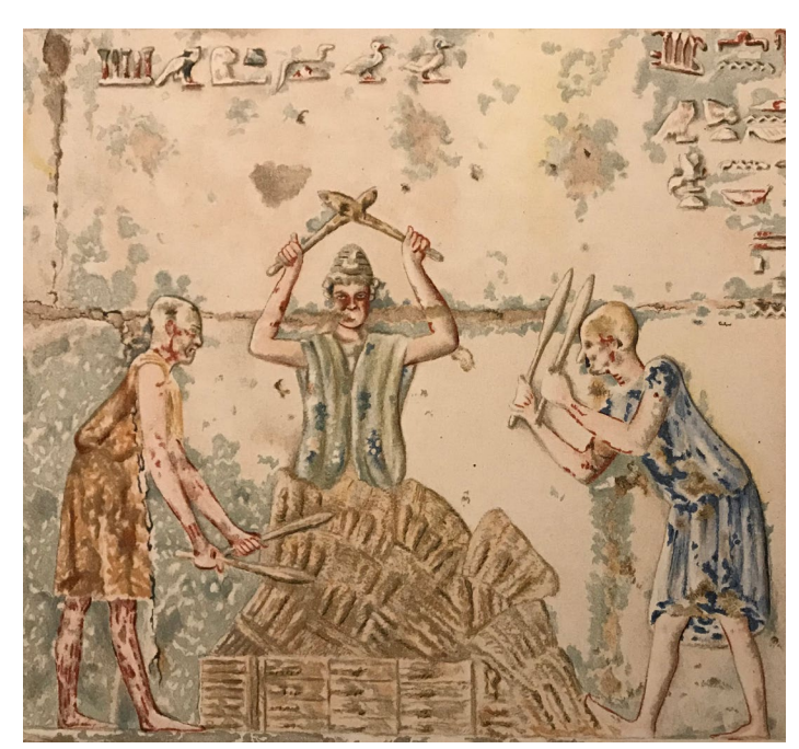
Figure 3. Hamzeh Carr, threshing scene from 4th-century BCE tomb of Petosiris, from Gustave Lefebvre, Le tombeau de Petosiris (Cairo 1924).