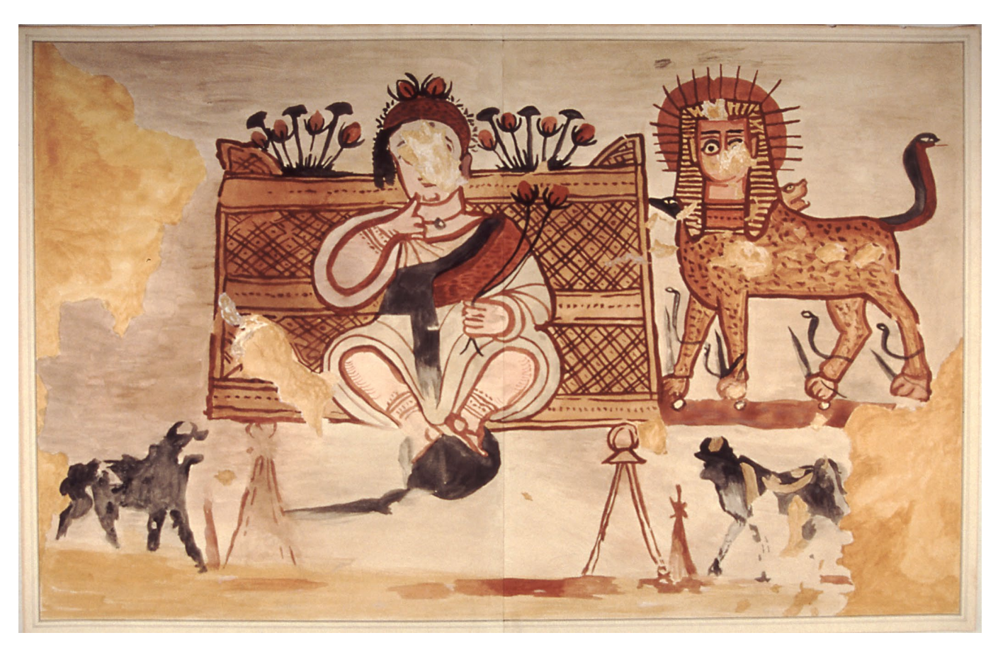
Figure 8. Hamzeh Carr, facsimile painting (watercolor and graphite on paper): Seated Harpocrates, wall painting in alcove of House C65CF4, Karanis (KM 2003.2.1).

May 1925, might have had at least a subconscious influence on his ideas for The Light of Asia.