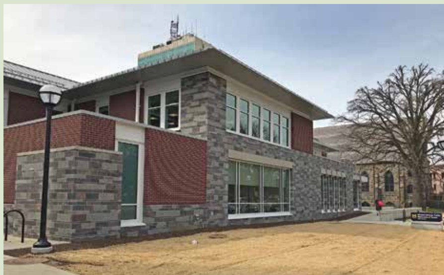
The new Trotter Multicultural Center.

The Kelsey Museum's new neighbor, the Trotter Multicultural Center, is open! Several Kelsey staff members attended the gala opening on April 11th, a festive occasion with a DJ, live music, food from many cultures, and speeches by university officials. Hundreds of U-M students, staff, and faculty were in attendance. According to its mission statement, the Trotter Multicultural Center "serves as a campus facilitator, convener, and coordinator of cultural competence and inclusive leadership education initiatives for University of Michigan students." The center is named after William Monroe Trotter, a major civil rights leader and advocate for African Americans in