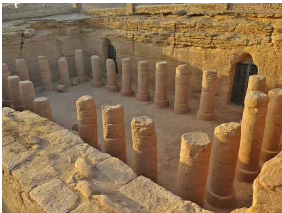
Figure 3. A view into the El-Kurru funerary temple.

Mark your calendar! Graffiti as Devotion along the Nile opens at the Kelsey Museum on August 23, 2019.