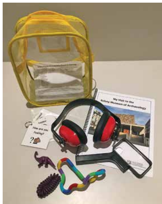
One of the Kelsey’s new Sensory Friendly Kits, now available in the galleries.

This spring we are surveying professors from all three U-M campuses to assess their need and interest in digital resources from the Kelsey. Over the summer we will begin to photograph and capture in 3D imagery of 100 objects from the Kelsey Museum’s collections.