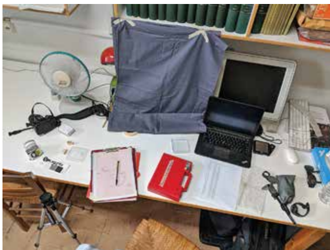
Photography and recording tools.

a complex of huts from the 7th–8th centuries BC. This season, we began with a small coring survey. There is almost a meter of unexcavated soil and we hope future excavation will extend the habitation record of the site into the 9th century BC or earlier.