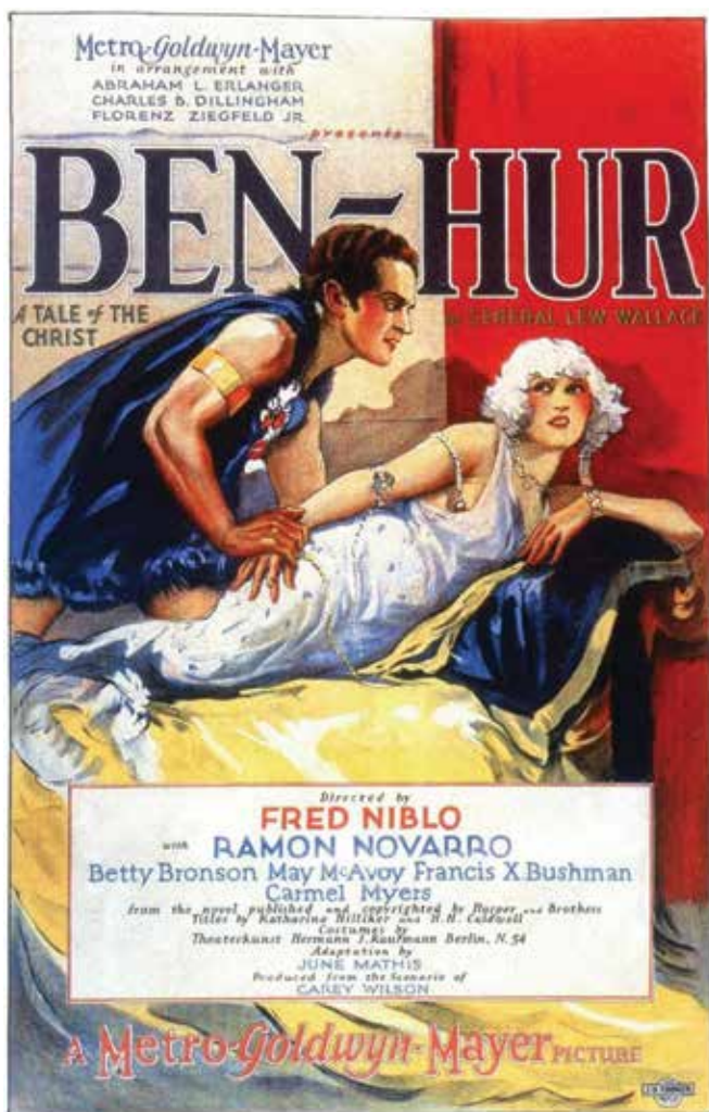
Figure 2. Movie poster for Ben-Hur (1925).