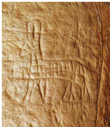
Figure 1. Graffito of the ram of Amun at the funerary temple at El-Kurru.

We found some archaeological layers in the temple that were probably associated with the carving of some of the graffiti. Those layers included a bunch of jars set upside down into the ground and with their bases broken off so they could serve as braziers (probably for incense; fig. 2). We took carbon dating samples from those jars and got results that suggest that some ritual activity took place there between 100 BC and AD 100, during what is called the Meroitic period in Sudan.