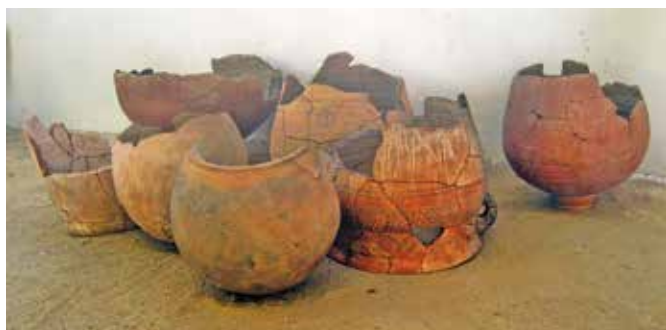
Figure 2. Jars dating to the Meroitic period from the funerary temple at El-Kurru.

refers to a religious practice — the ram of Amun was almost certainly carved during the time that Amun was worshipped (a practice that ended by the 4th century AD in Nubia), and any Christian symbol like a cross or a church was carved after the arrival of Christianity in the 5th century AD.