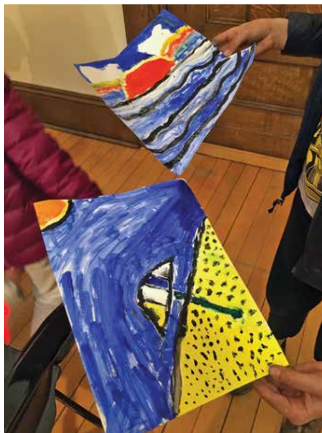
Artworks created at Family Day: Ancient Color.