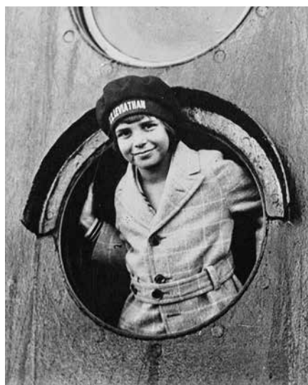
Figure 5. Jackie Coogan on board the SS Leviathan in 1924.