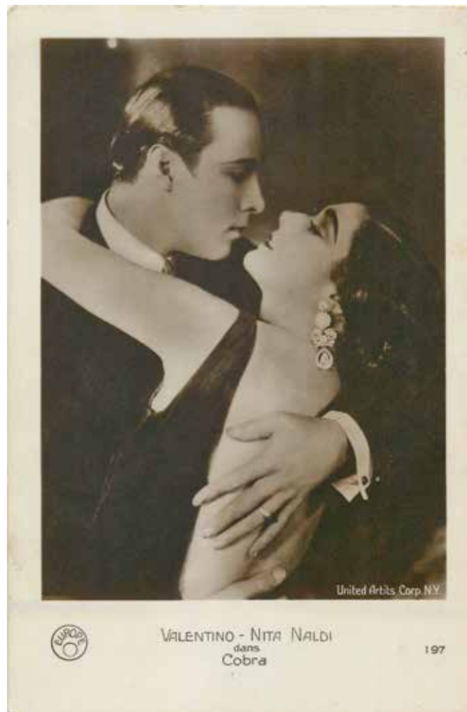
Figure 3. A publicity still from Cobra (1925), starring Rudolph Valentino and Nita Naldi.

Kelsey also records a brush with silent film culture in 1924, and this incident is perhaps even more suggestive of his tastes and attitudes. In November of that year, Kelsey traveled from England to New York on the SS Leviathan , on which his fellow travelers included movie stars Rudolph Valentino and Nita Naldi — then the top screen “Latin lover” and one of the top “vamps,” respectively (fig. 3). Valentino and Naldi were returning from making a film together in Europe ( Cobra , released in 1925 and available online at https://archive.org/details/Cobra_784 ), on their way to begin another joint film project, later abandoned. Kelsey did not meet either of them; given what we