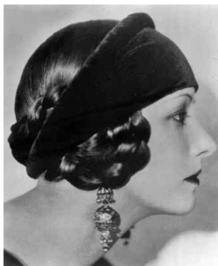
Figure 4. Natacha Rambova publicity photo.

Kelsey also records a brush with silent film culture in 1924, and this incident is perhaps even more suggestive of his tastes and attitudes. In November of that year, Kelsey traveled from England to New York on the SS Leviathan , on which his fellow travelers included movie stars Rudolph Valentino and Nita Naldi — then the top screen “Latin lover” and one of the top “vamps,” respectively (fig. 3). Valentino and Naldi were returning from making a film together in Europe ( Cobra , released in 1925 and available online at https://archive.org/details/Cobra_784 ), on their way to begin another joint film project, later abandoned. Kelsey did not meet either of them; given what we