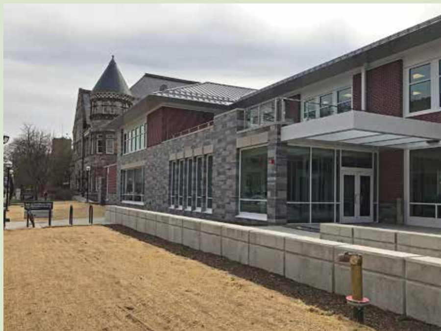
The Trotter Center from the north, with the Kelsey Museum in the background. Note how the stonework echoes that of the Kelsey.

the late 19th and early 20th century. Given the diverse and multicultural nature of the ancient Mediterranean and Near East as represented in our collections, the Trotter Center is the perfect modern complement to the Kelsey, and we are thrilled to welcome them to the neighborhood!