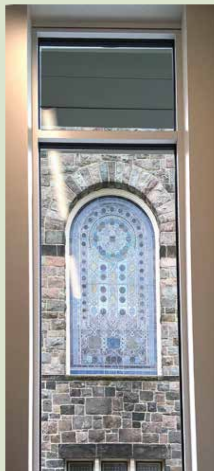
The Kelsey's Tiffany window from the south stairwell in the Trotter Center.