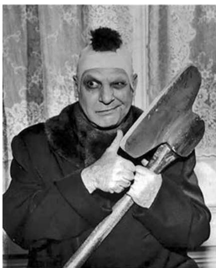
Figure 6. Coogan as Uncle Fester in a 1965 publicity shot for The Addams Family.