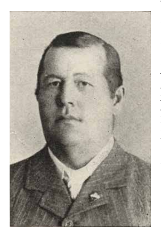
Fig. 6.17. Photograph of the Reverend Chauncey Murch, a missionary, collector, and purveyor of antiquities who was stationed in Luxor, Egypt, in the 1880s (Hartshorn, Merrill, and Lawrence 1905, p. 359).

offerings—a type for which the Museum has an actual Middle Kingdom example (fig. 6.15), a gift from Professor Peterson, who must have acquired it while serving in Egypt as director of the Karanis excavations. Overall, the Bay View objects are impressively varied. A favorite among Museum visitors is an entire cat mummy in its decorated linen wrapping, one of numerous attestations of the feline cults in ancient Egypt (fig. 6.16). 96