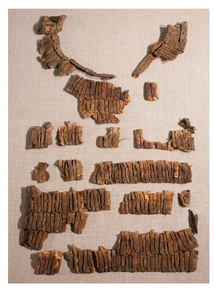
Roman leather armor found at Karanis. 3rd-4th c. CE. KM 3631.