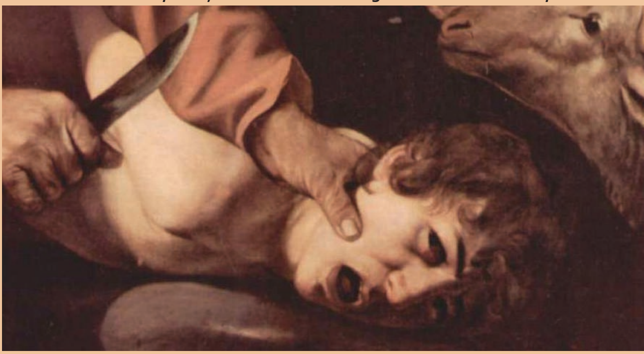
Detail from Caravaggio's Sacrifice of Isaac (1603)