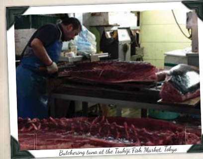
Butchering tuna at the Tsukiji Fish Market, Tokyo