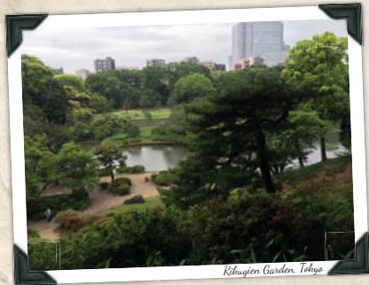
Rikugien Garden, Tokyo

ACT FIVE: The mountain town of Nikko is home to shrines, temples, and a museum dedicated to the first Tokugawa shogun, Ieyasu, whose rule began the relatively peaceful Edo period. The students explored the beautifully lush landscape dotted with points of historical interest.