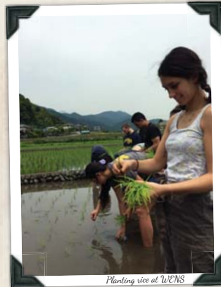
Planting rice at WENS

ACT TWO: Rikugien is an Edo-era strolling garden complete with ancient trees, a large koi pond, and meandering paths in the heart of bustling Tokyo. Everything was manicured "down to the smallest shrub in the far corner of the garden," wrote Kerrel Spivey. Yet the tall trees provided canopy to keep the hot day cool, and a tea house