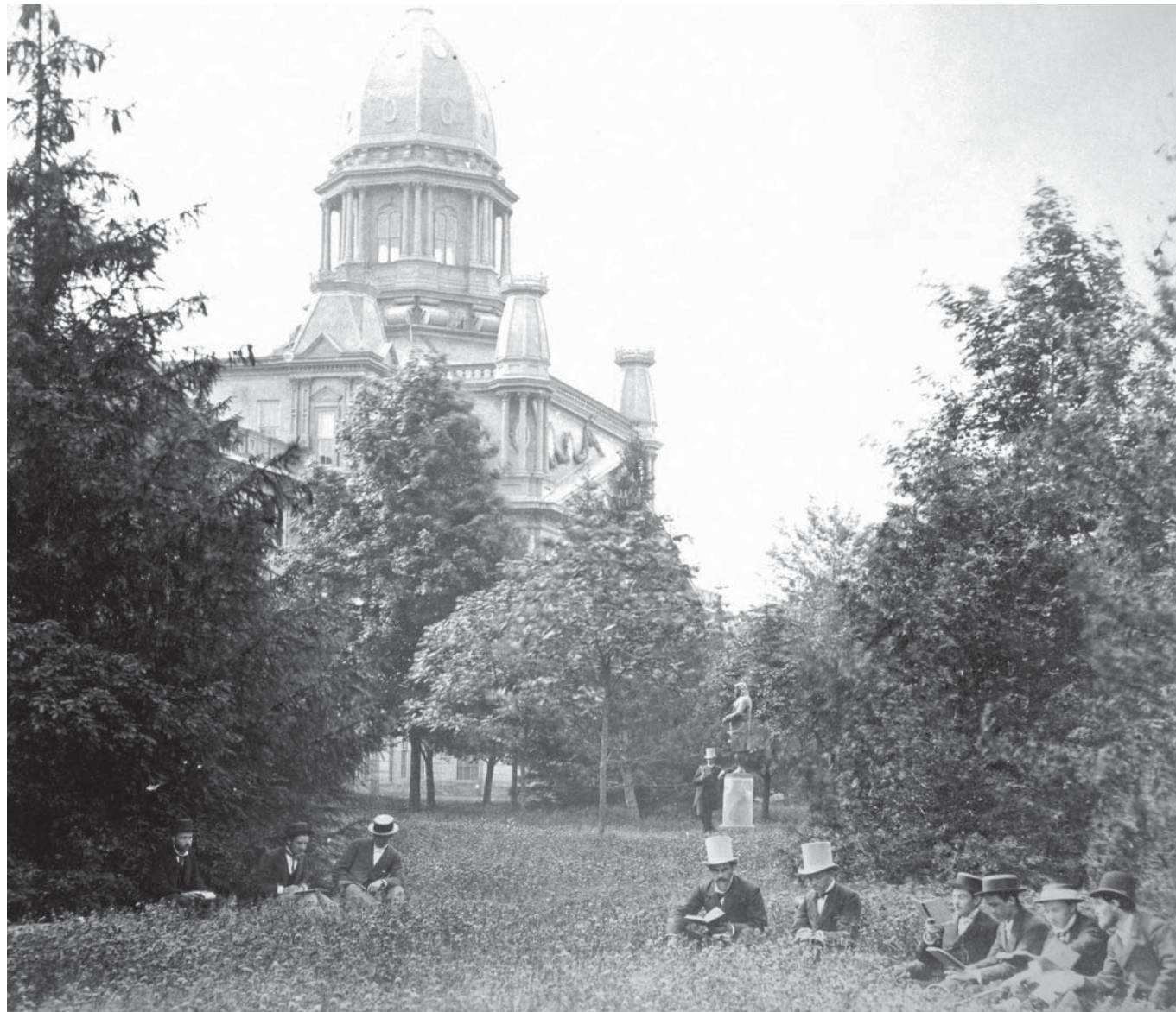
Sophomore class of 1877 in front of University Hall.

“As important to this process is memory, which is not the same as history. Here we are asking what of the university’s past can and should we remember, recall, and memorialize, and how should we do that.”