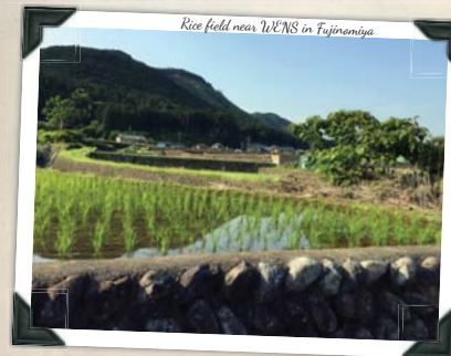
Rice field near WENS in Fujinomiya