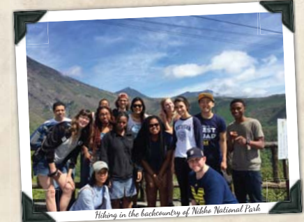
Hiking in the backcountry of Nikko National Park

ACT SEVEN: In and out. Tokyo sees more than 2,300 tons of seafood per day move through its Tsukiji Fish Market. Aside from the intense smell of fish and blood, the place is abuzz with haggling fishermen and restaurant owners, knives on the chopping blocks of fish wholesalers, and electric carts whizzing past clueless tourists. As the market winds down after 9 a.m., visitors are jostled and splashed as vendors empty their tanks onto the cobblestones. Not a scene everyone enjoyed equally! "Post-market, instead of indulging in the day's catch, I recuperated with fishless maple toast," Anna Norman blogged.