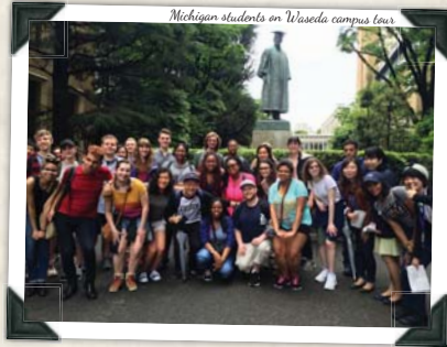
Michigan students on Waseda campus tour