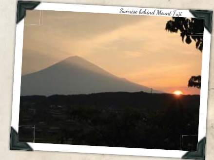
Sunrise behind Mount Fuji

ACT SIX: Not far from Nikko are the Ashio Copper Mines. Active from the late 1700s, intensive mining operations began with Japan's industrialization and devastated the surrounding mountain environment. Restoration work continues, and the students met with the nonprofit Forest N' People Project Organization, who explained their long-term effort to reverse the damage. Each student planted a seedling in hopes that it would withstand the contaminated soils and help restore the ecology of the mountain slopes. Later, students toured part of a 1,500-meter shaft where they saw historical tableaux depicting underground labor—figures using rudimentary Tokugawa-era tools and Meiji-era mechanical drills and explosives.