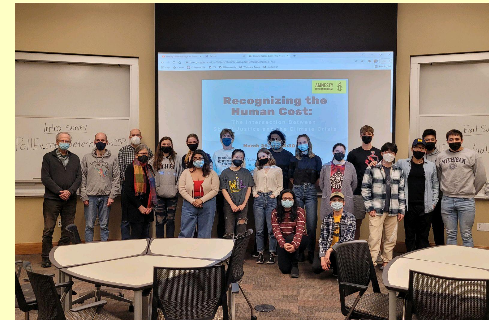
Everyone that attended "Recognizing the Human Cost: The Intersection Between Social Justice and the Climate Crisis!"