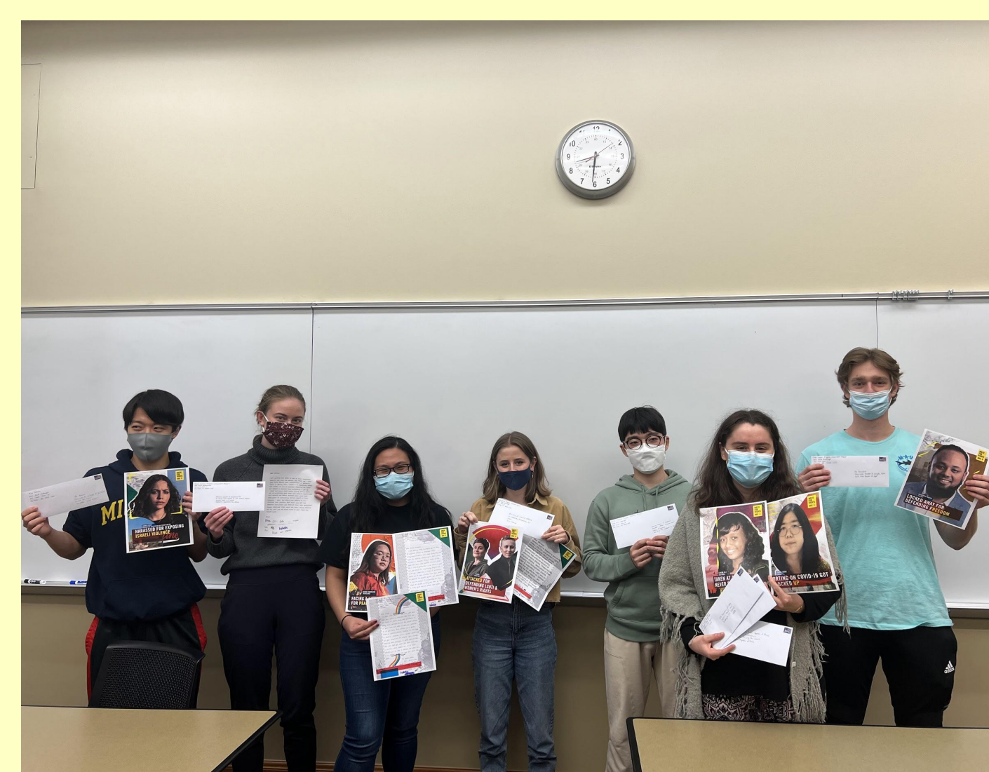
This is us with the letters we wrote for the Write for Rights campaign and a poster we created to promote it!