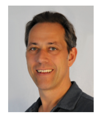
of Bees," or... reading and engaging with German literature in all of the above.

I hope you'll find plenty of interesting news in the following pages and invite you, as ever, to stop by and see us: as much as we like to share what goes on here, we love hearing what goes on in the lives of our friends and alumni beyond Michigan!