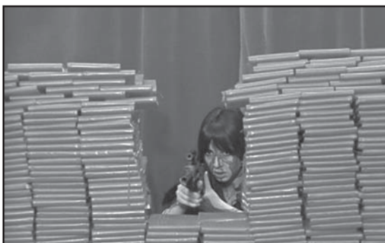
Jean-Luc Godard's La Chinoise (1967)