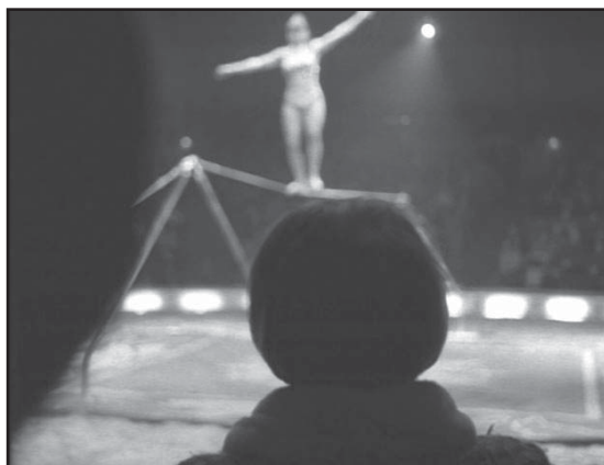
Alexander Kluge's Artists in the Big Top: Perplexed (1968)

of the enormous success of this event than the ongoing investment in the German Film Institute by scholars, the directors, and the sponsors alike. We thus remain grateful to all units and sponsors involved in making this event possible, including: the German Academic Exchange Service (DAAD); The Department of Germanic Languages and Literatures and its superb staff; The Department of Screen Arts and Cultures; The Office of the Vice President for Research; The College of Literature, Science, and the Arts (LS&A); The Rackham Graduate School; The International Institute; the Institute for the Humanities; and ISS.