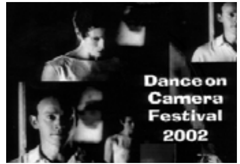
Still image from Measure by 33 Fainting Spells, 2001