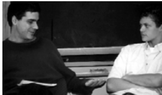
In November 2002, Miguel Arteta ( Star Maps : Director, The Good Girl ) shared his journey as an independent filmmaker on Star Maps . Four screenplay first acts were read in class followed by Arteta's critique.