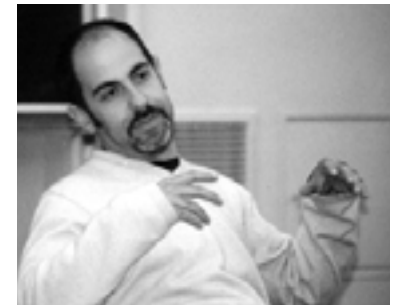
David Goyer ( Blade ), December 2001. Along with returning to his hometown, Ann Arbor, and screening his film, ZigZag , Goyer did an evening discussion on his dual process of writing and directing ZigZag for Film & Video's screenwriters.