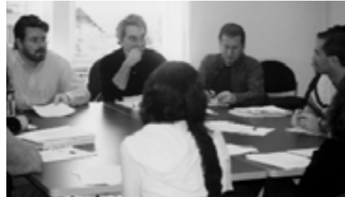
Christopher McQuarrie ( The Usual Suspects ), October 2001. McQuarrie did three full days of master class lectures and individual scene work with the upperclass screenwriters.