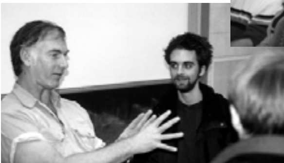
Screenwriter/filmmaker John Sayles ( Lone Star ), April 2002. Sayles spent an afternoon with the Film & Video screenwriters sharing his vast knowledge and experience.