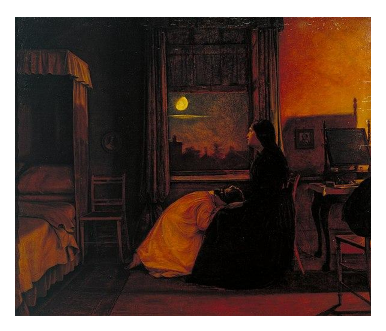
Figure 3: Augustus Egg, Past and Present, No. 2, 1858, oil on canvas, 635 x 762 mm