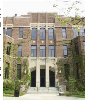
School of Education