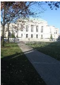
Rackham Graduate School