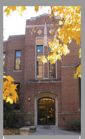
School of Education

Hail! to the victors valiant Hail! to the conqu'ring heroes Hail! Hail! to Michigan. the leaders and best Hail! to the victors valiant Hail! to the conqu'ring heroes Hail! Hail! to Michigan, the champions of the West.