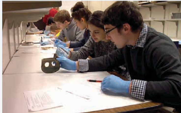
Students working with ancient artifacts from Israel/Palestine at the Kelsey Museum as part of the exercises developed by TLTC.