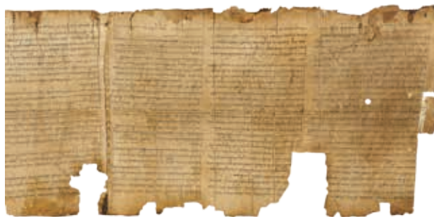
Part of the Great Isaiah Scroll, one of the Dead Sea Scrolls "Psalms Scroll" by the Israel Antiquities Authority 1993; photographer not named. – Library of Congress. Licensed under Public Domain via Commons

Christian–Muslim Relations Online (CMR Online) is the online version of the first five volumes of the series Christian–Muslim Relations: A Bibliographical History , covering the period 600 to 1500 CE. CMR Online II begins with volume six and once completed, will cover all parts of the world from the year 1500 to 1914. The CMR Online resource allows for full-text, cross searching and browsing of the volumes appearing in this important series.