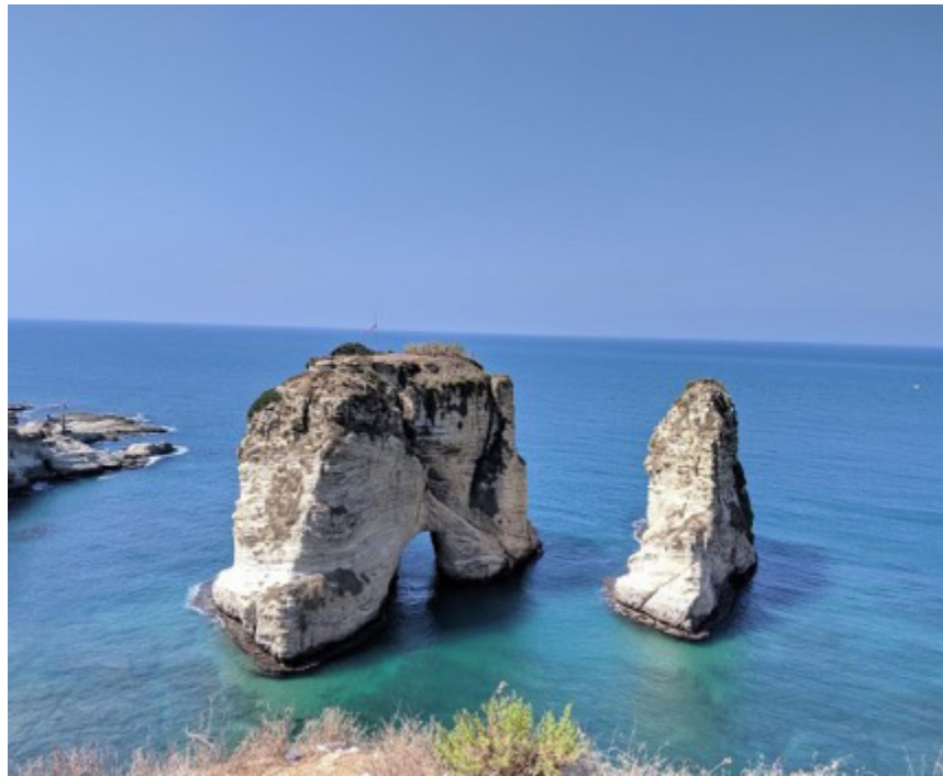
La Raouché, Beirut.

OPPOSITE, CLOCKWISE FROM TOP Beirut souks .