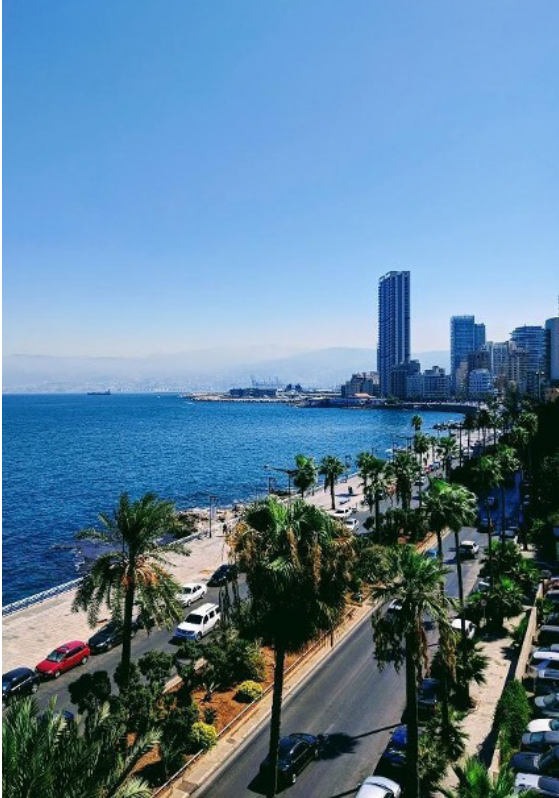
View of “La Corniche” (seaside boardwalk) from the AUB campus.