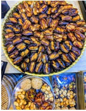
Dates and nuts at a local market in Beirut.