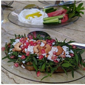
Delicious vegetarian appetizers at Tawlet in Beirut.