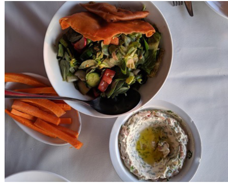
The traditional Lebanese hummus and fattoush salad at a local restaurant.

Our schedule in Beirut includes two days of meetings and discussions with our partners at AUB, a group of incredibly talented faculty and leaders interested in cross-cultural learning opportunities for their students. We were there to refine the course design and curriculum, discuss implementation plans, and finalize the details of the virtual exchange. All of this against the backdrop of Beirut—a city famed for its history, charm, chaos, and contrast. I like my charm with a side of chaos, so I eagerly step off the plane and into the city in the middle of the afternoon, ready to explore.