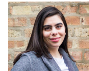
CMENAS Outreach Assistant

History of Art Major, Concentration in Political Science and Criminal Justice