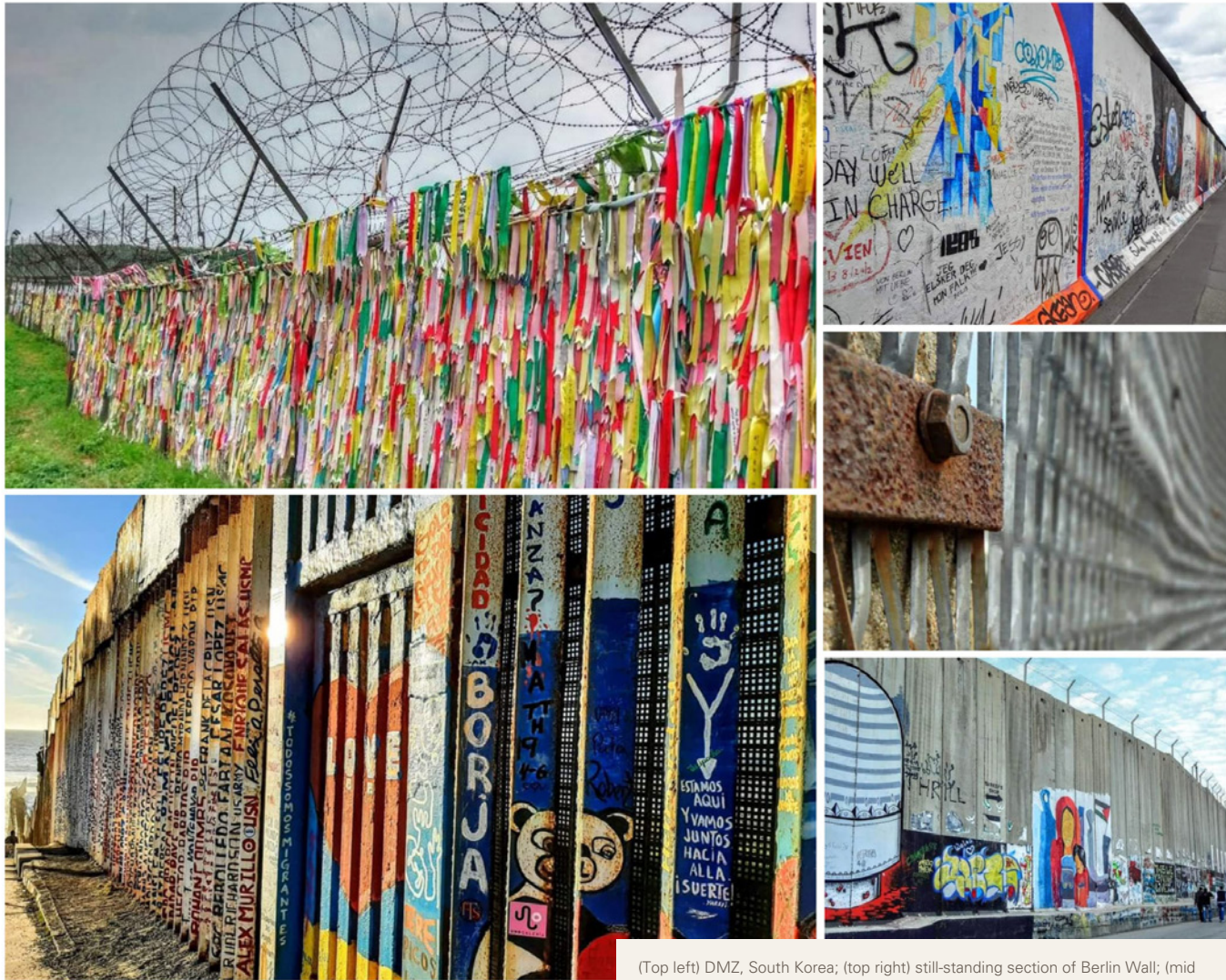
(Top left) DMZ, South Korea; (top right) still-standing section of Berlin Wall; (mid right) remnants of the Iron Curtain, Fulda region of central Germany; (bottom right) Israel's Separation Wall snaking through Bethlehem neighborhood; (bottom left) the US-Mexico border wall.