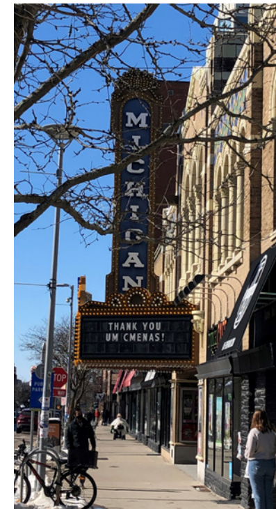
TOP: Faten Hamama stars in the 1959 Egyptian classic "Nightingale's Prayer." BOTTOM: The marquee of the Michigan Theater.

The 1959 Egyptian classic "Nightingale's Prayer" played at Ann Arbor's State Theatre on Sunday, February 20th, starring the first lady of the Arab silver screen Faten Hamama. Based on the novel by the great Egyptian author Taha Hussein and directed by Henri Barakat, this compelling tale of love and betrayal is set in the upper Egyptian countryside and follows the story of Amna (Hamama) as she plots her revenge on the engineer (Ahmed Mazhar) who destroyed her family's honor. A gripping portrait of a courageous young woman's rebellion against tradition and poverty, this film is an undiscovered masterpiece of world cinema. The Michigan Theater Foundation thanked CMENAS for its sponsorship of the screening: "After a difficult year, we were so thrilled to be able to once again have people in our theater and we couldn't have done it without you!"