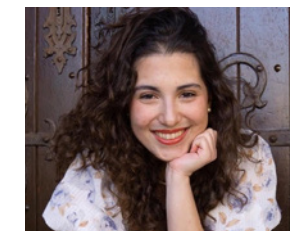
Student Researcher, Program in International & Comparative Studies and CMENAS

Master of Urban and Regional Planning Candidate