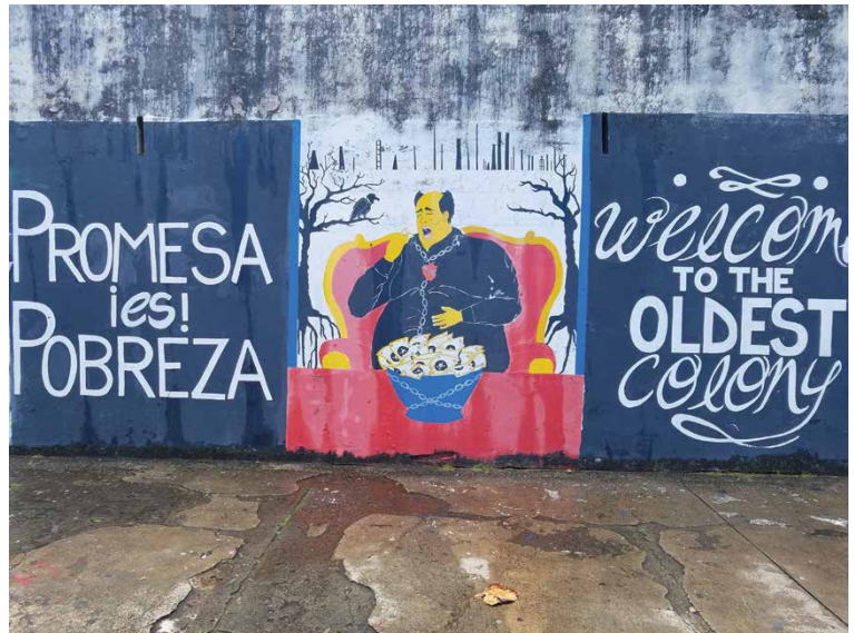
A mural located in Old San Juan. The Spanish means, "Promise is poverty."

demands around women's rights, and, as I write in late July 2019, the teacher's strikes have merged with broader protests against corruption, mis-management of public resources, and rising poverty rates. And on July 24th, the streets erupted in celebrations after a massive protest march led to the resignation of Governor Rosselló.