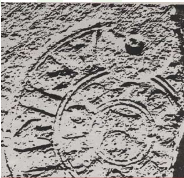
Roman Stamped Brick, Kelsey Museum of Archaeology