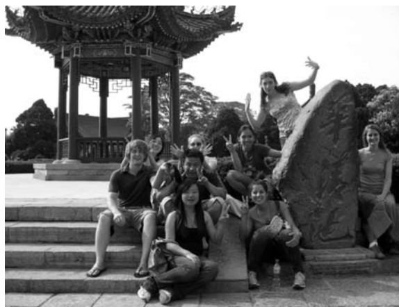
PKU students in a light moment