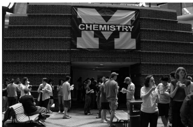
Annual Graduate Awards Icecream Social on June 25, 2009