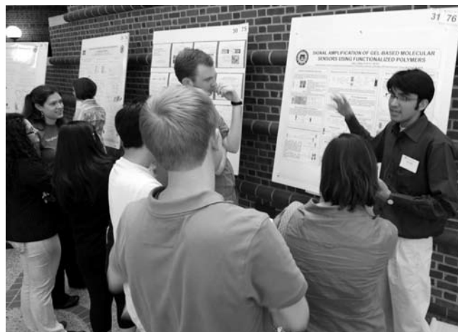
A Graduate Student poster presentation at the Vaughan Symposium