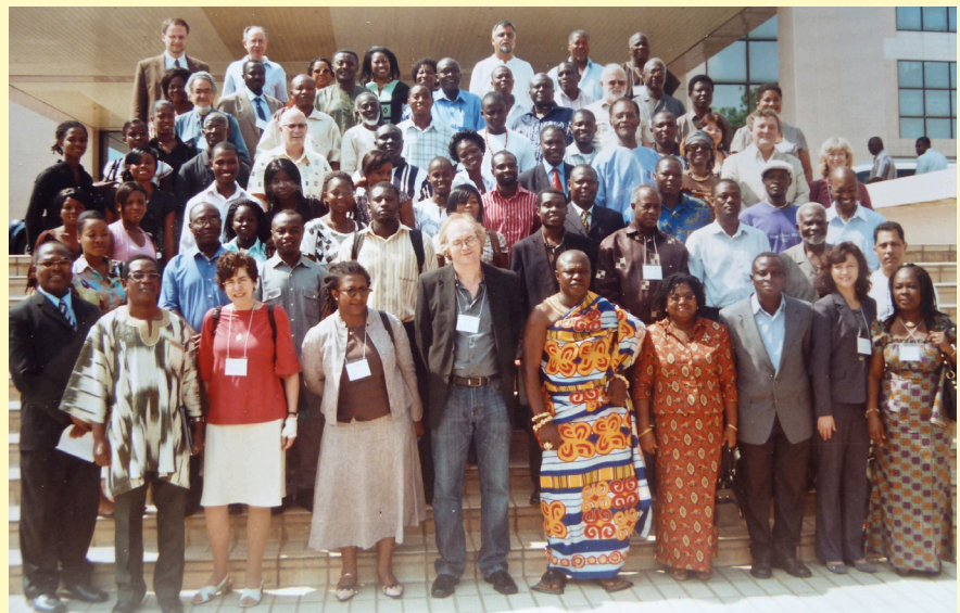
Accra conference attendees

The Accra conference is the first of three conferences to be organized by the African Studies Center's African Heritage initiative. Plans for a second conference, to be held in Johannesburg in July 2011, are described elsewhere in this newsletter (see page 11). ❀