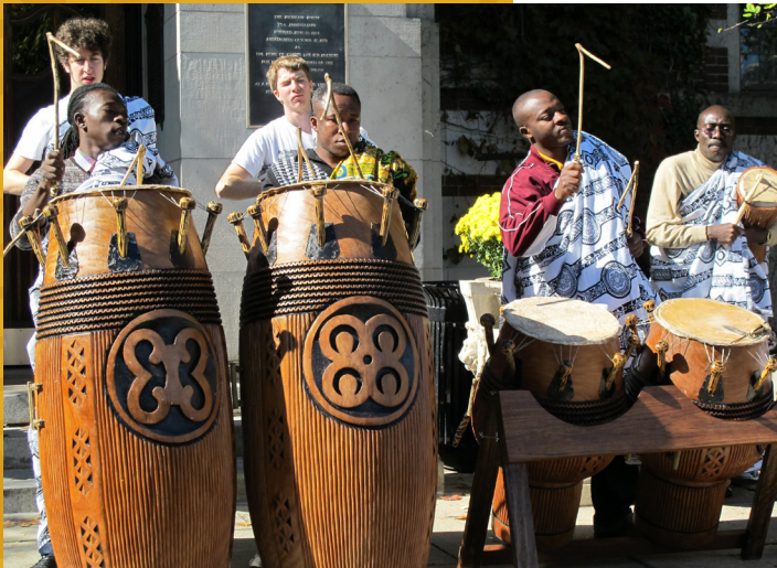
Fontomfrom drummers with Michigan students on steps of the Union