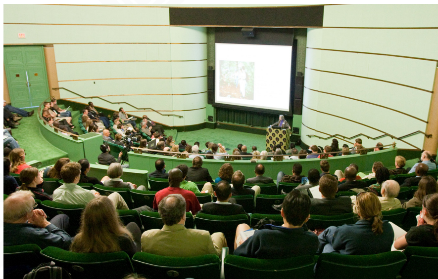
Nobel laureate Elinor Ostrom addresses a plenary session