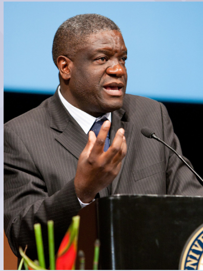
Dr. Denis Mukwege at Rackham auditorium

Congolese physician Dr. Denis Mukwege was awarded the 20th U-M Wallenberg Medal on November 16, 2010, during a ceremony at Rackham Auditorium. Mukwege is a leader in the movement to highlight the continued problem of sexual violence in the Democratic Republic of the Congo. He is the director of Panzi Hospital, in Bukavu in the eastern Congo, where he specializes in the treatment of women who are victims of the sexual violence that since the 1990s has been part of the catastrophic civil wars in the Congo and Rwanda. He is one of the world’s leading experts on how to repair the internal physical damage caused by rape.