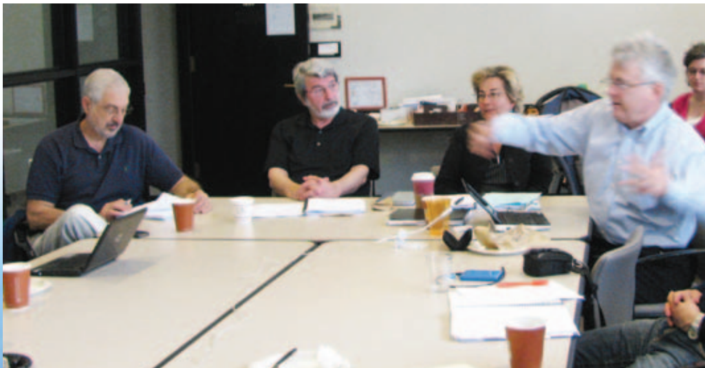
ASP and Near Eastern Studies faculty and graduate students participate in spirited exchange during the 3rd Annual International Graduate Student Workshop.