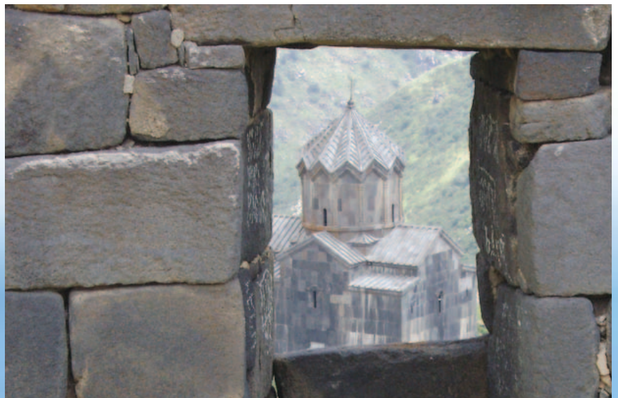
Above: “History Through a Peephole.” A view of the 11th century Vahramshen Church through the walls of the 7th century Amberd fortress.