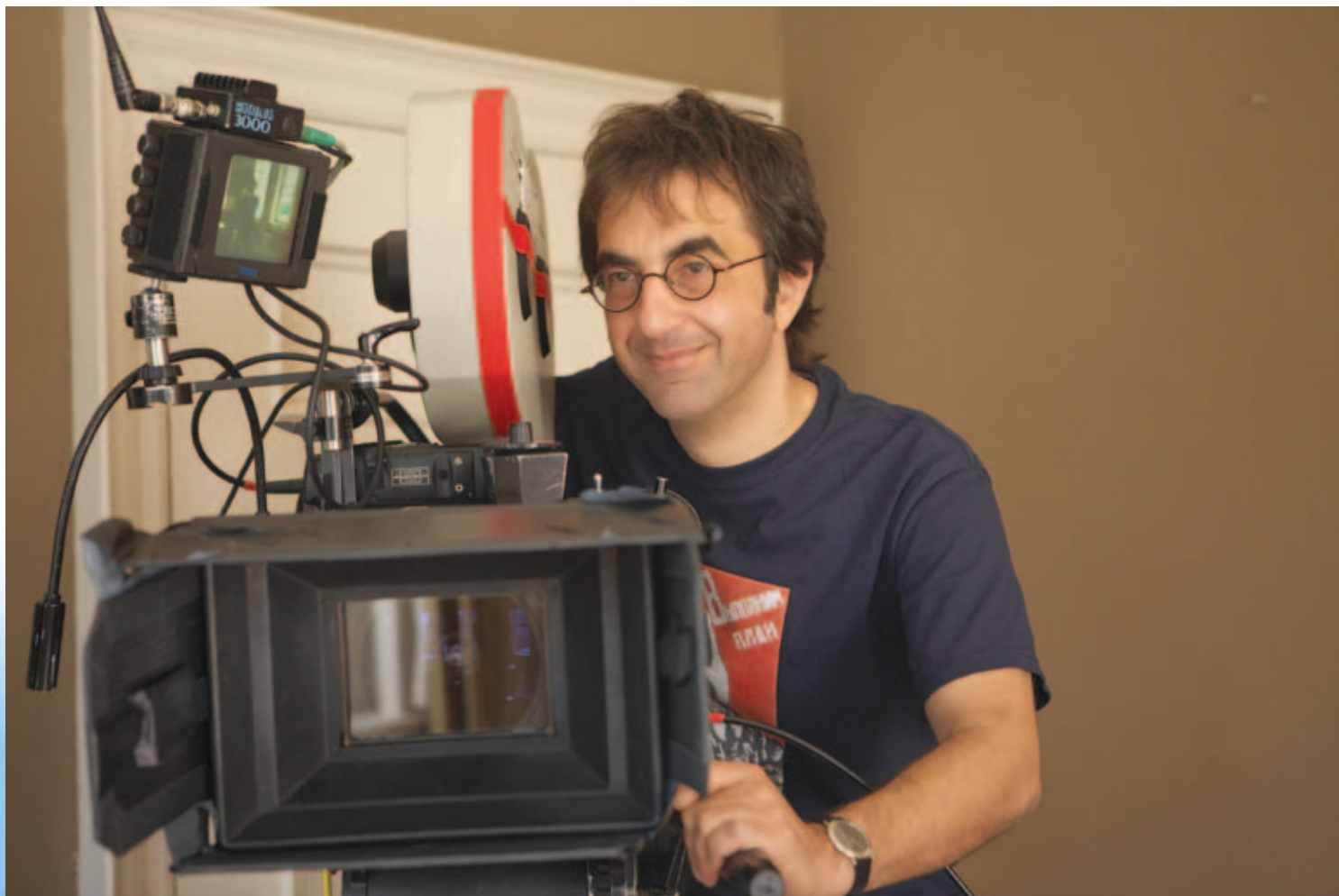
Above: Atom Egoyan.