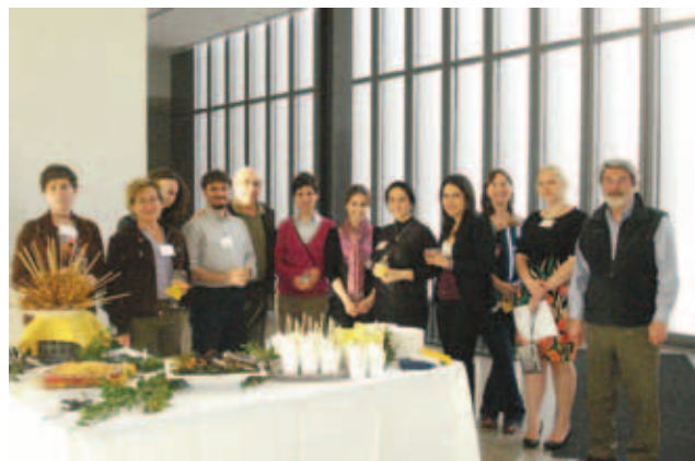
Third Annual Grad Student Workshop Reception