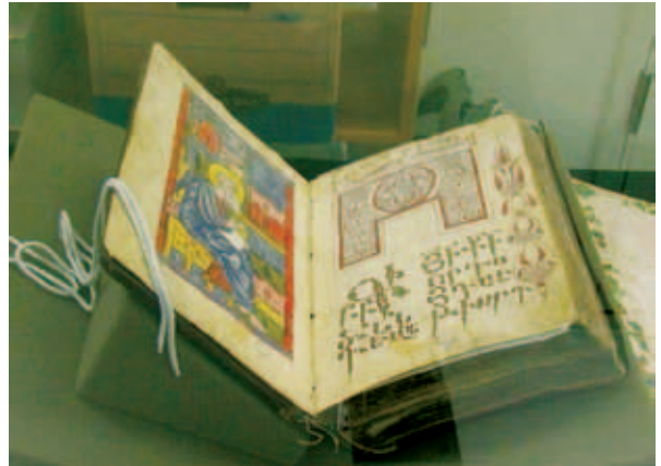
13th century manuscript from Special Collections

videotapes/DVDs, Armenian Genocide oral histories and almost 20,000 newspaper articles clipped and placed in vertical files.