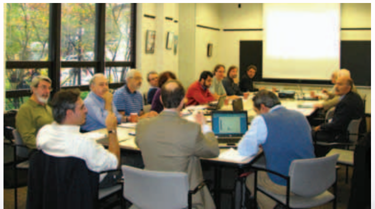
Workshop on the State of Armenian Studies