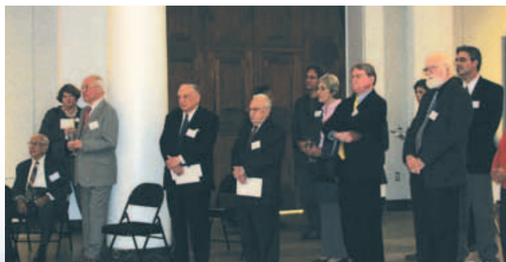
Armenian Studies 30th Anniversary Reception