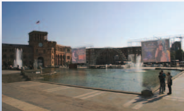
Republic Square Fountain, Yerevan

Our current focus is recording as many interviews as possible. We hope to have interviews with at least forty subjects before we complete our project. Meanwhile we are encouraging others in Armenia to develop their own projects, since it will be impossible for us to interview everyone whose story should be recorded. These completed interviews will be made available to researchers. Copies will be made available here at U-M and in selected locations in Armenia.