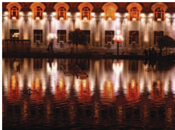
Republic Square, Yerevan