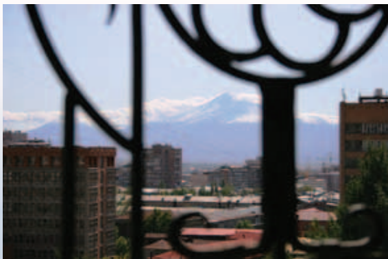
Ararat from Matenadaran