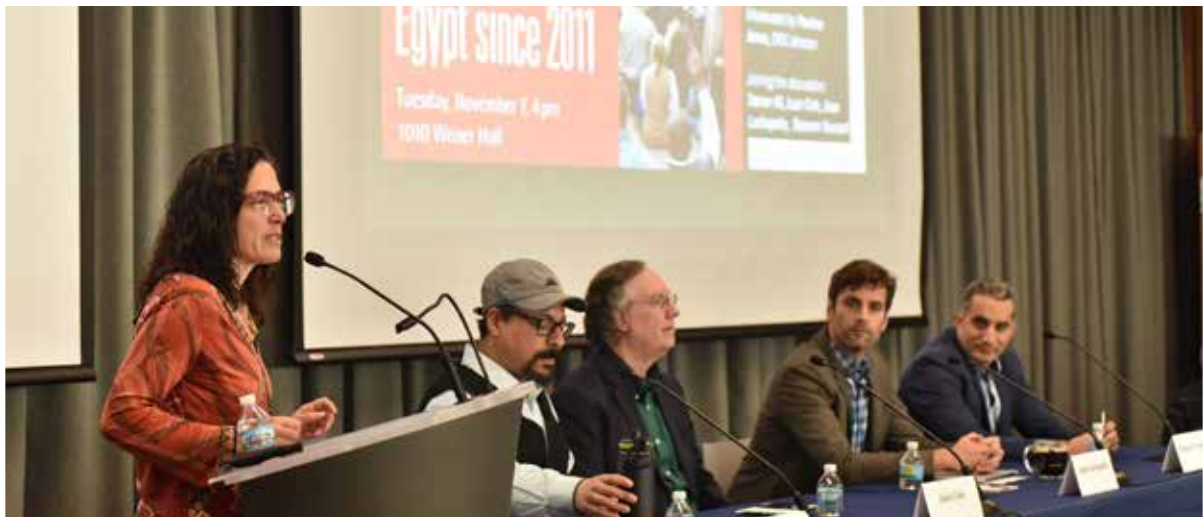
"Unraveling the Arab Spring: Egypt since 2011" panelists