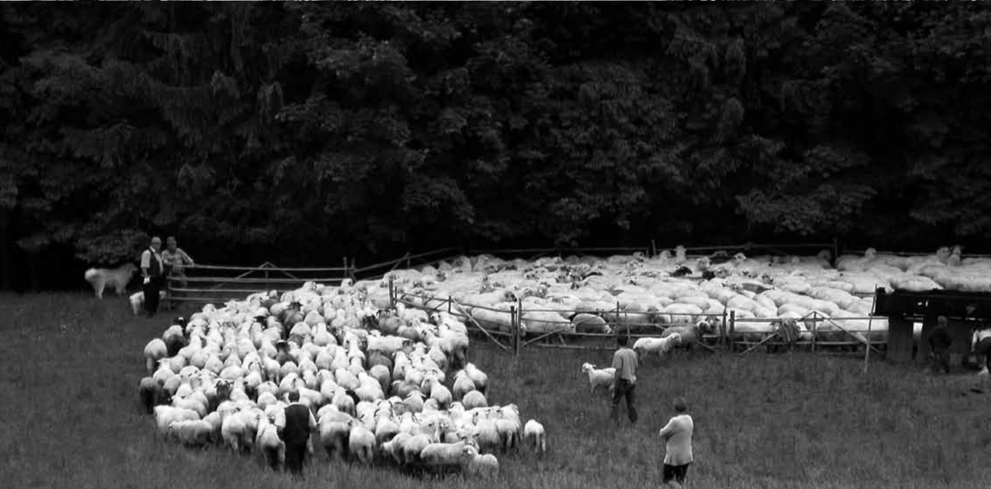
Above: top - Sardinia; bottom - Zakopane / Right: Afghan boys