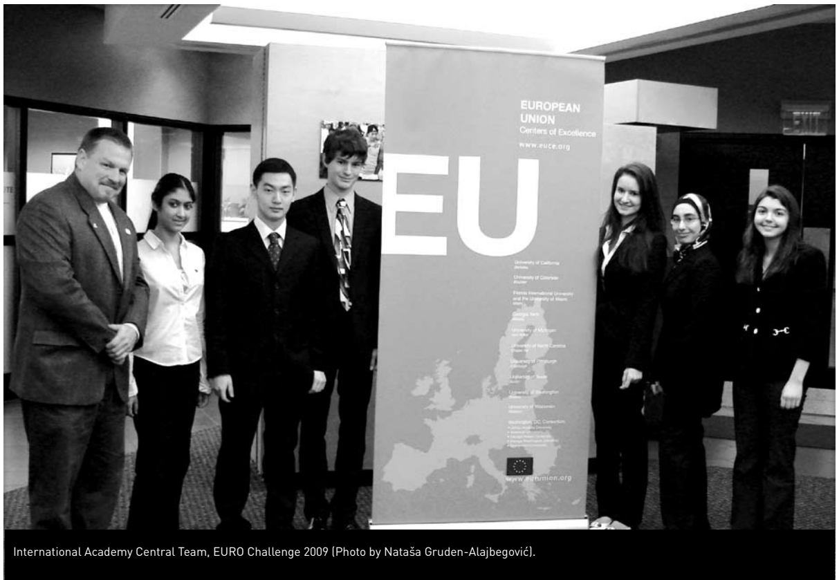
International Academy Central Team, EURO Challenge 2009 (Photo by Nataša Gruden-Alajbegović).