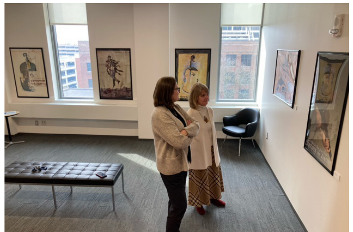
CCPS Exhibition “Fiddler on the Roof: A Story Told on Polish Posters”