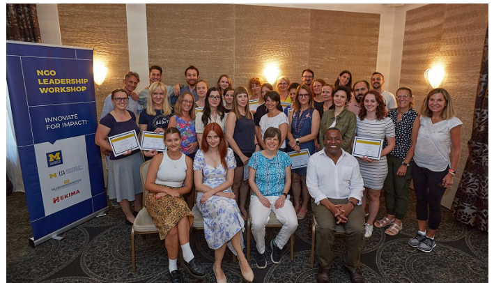
NGO Leadership Workshop participants with trainers and organizers in Bratislava, Slovakia