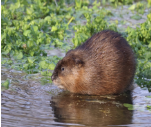
6. Ondatra zibethicus , *zhashkonh Muskrat: Medium (8-14 in) semiaquatic rodent with reddish brown fur and a long, slender, scale-covered tail. They may swim underwater for 12-17 minutes.