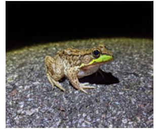
10. Lithobates clamitans , *nitaagabi-makkii Green Frog: Mid-size (2-4 in) frog with a green head (males have bright yellow throats) and brownish or dark green body. They have prominent seam-like skin folds running down the sides of the back.