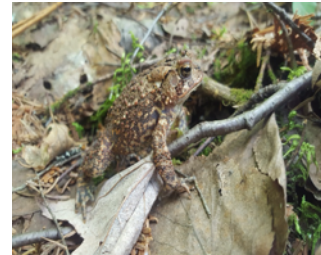
12. Anaxyrus americanus , *bbiigmakii American Toad: Medium-sized (2-3.5 in) toad. Color ranges from yellow to brown to black and may be solid or speckled with a warty skin texture.