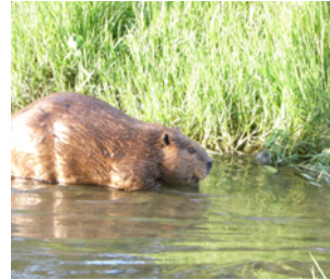
8. Castor canadensis , *amik American Beaver: Large (29-35 in) semiaquatic rodent with brown fur and wide, flat, paddle-shaped tail. Signs of beavers include lodges and dams made of sticks and logs, and the presence of chewed-off tree stumps.