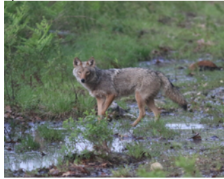
7. Canis latrans , *wiisagi-ma'iingan Coyote: Small canine with gray, red, black, and white fur and a large bushy tail. Most characteristic vocalization is a howl by solitary individuals and yipping in a pack.