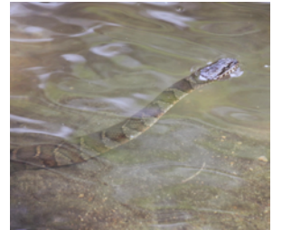
15. Nerodia sipedon , *masdamoonh Common Watersnake: Large (4-5ft) snake may be brown, gray, reddish, or blackish, with dark crossbands on the neck and blotches on the rest of its body. Non-venomous.