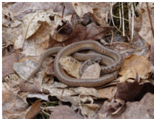
16. Storeria dekayi , *gnebig Dekay's Brownsnake: Small (8-18 in) snake is brown to gray with a lighter center stripe bordered by small black spots. Non-venomous.