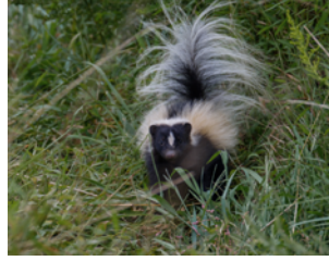
3. Mephitis mephitis , *zhigaag Striped Skunk: Medium- (20-30 in) sized mammal with distinctive black and white stripes and a large tail. Possess musk-filled scent glands to ward off predators.