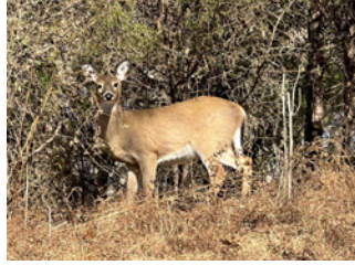
2. Odocoileus virginianus , *waawaashkeshi White-tailed Deer: Medium-sized brown deer with white undersided tail. Males grow antlers between April and November but shed them in early winter. Females are smaller with no antlers. Fawns have white spots for the first several months.