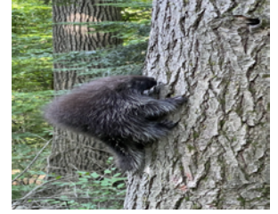
5. Erethizon dorsatum , *agaak North American Porcupine: Large (24-36 in), quill-covered rodent, emits a strong musky body odor. They are generally dark brown with white highlights and have a stocky body with small face, short legs and a thick tail.