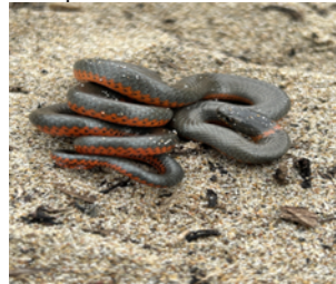
13. Diadophis punctatus edwardsii , *gnebig Northern Ringneck Snake: Medium (10-24 in) with a bluish-black body and a complete narrow yellow or orange ring around its neck. Venomous, but harmless to humans.