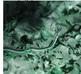
14. Thamnophis sirtalis , *wendagnebik Common Garter Snake: Thin, medium-large (22-48 in) snake. Blackish brown with yellow stripes. Venomous, but harmless to humans.