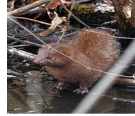
4. Neogale vison , *zhaangwesh American Mink: Small (12-18 in), semi-aquatic mammal. Brown fur, long slender body. Long, bushy, tapering tail.