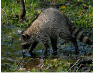
1. Procyon lotor , *eziban Common Raccoon: Medium- (16-28 in) sized mammal with gray and black fur, dexterous front paws, a black facial mask, and a ringed tail.