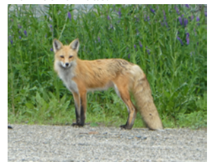
20. Vulpes vulpes , *waagwash Red Fox: Small canine with red coat black legs, and a large bushy tail. Vocalization is wide ranging and often disconcerting.