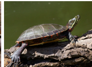
17. Chrysemys picta , *mskwaadenhs Painted Turtle: Medium (5-10 in) turtle with a dark smooth top shell. Skin is olive to black with red, orange, or yellow stripes on its extremities.