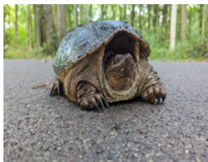
18. Chelydra serpentina , *mikinaak Common Snapping Turtle: Large turtle (10-20 in) with a combative disposition, powerful jaws, and a highly mobile neck and head. Weigh 13-50 lbs and can live up to 100 years.