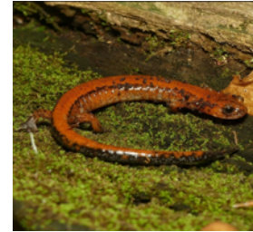
9. Plethodon cinereus , *Dawgomek Eastern Red-backed Salamander: Small (2-4 in) terrestrial salamander with a black and brown body and reddish orange back. It generally lives in forests under rocks, logs, and other debris.