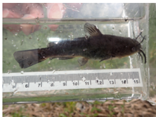
2. Ameiurus nebulosus , *awaazisii Brown Bullhead: Similar to the black bullhead, but lighter in color with brown-black speckles along the entire surface of the fish. Barbels are yellow.