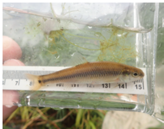
7. Pimephales notatus , *giigoozens Bluntnose Minnow: Three inch long minnows with a pale olive upper body and silvery lower body. They have a rounded head and terminal mouth.