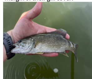
10. Micropterus dolomieu , *noosa'owesi Smallmouth Bass: Slender but muscular body with golden-olive to dark brown scales and dark brown vertical bars across the body but horizontal stripes on the head.