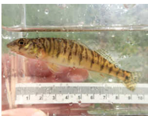
16. Percina caprodes Common Logperch: Widespread logperch with the typical vertical barring along its sides and a subterminal mouth.