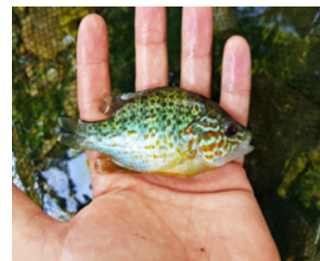
5. Lepomis gibbosus Pumpkinseed: Small body shaped much like a pumpkin seed, with orange, green yellow, and blue scales and speckles over their sides and back and a yellow-orange belly. They have an orange-red spot on the margin of their gill cover.