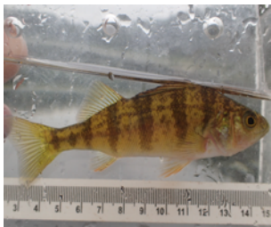
6. Perca flavescens , *saawe Yellow Perch: Elongate body with a blunt snout and longer lower jaw. They have a yellow-green body with 6-8 darker vertical bars along their length.