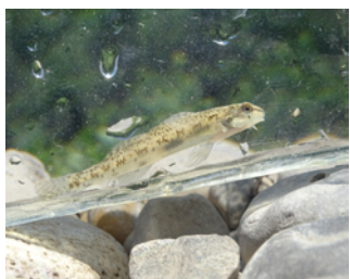
12. Etheostoms nigrum Johnny Darter: Small, slender fish with yellow scales, paler sides, and whitish bellies. They have a series of brown or black markings along their sides and two dorsal fins.