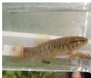
13. Umbra limi Central Mudminnow: Small elongate fish burrows tail first into mud. It is brownish on top with pale sides and belly.