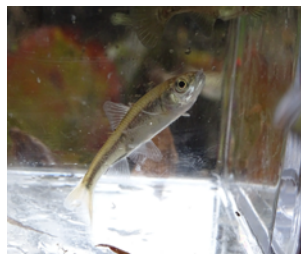
8. Luxilus cornutus Common Shiner: 4-6 inch fish with silvery-colored body with an olive back and dark dorsal stripe. Breeding males have a reddish/pink tint.