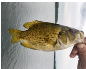
3. Ambloplites rupestris , *gwadaash Rock Bass: Native to the Great Lakes. These fish have yellow-green-black scales and can change their color to match their surroundings. They are distinguished by red eyes and six anal fin spikes.