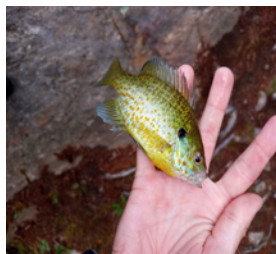
9. Lepomis gibbosus x macrochirus , *akwataashii Pumpkinseed x Bluegill: Appearances vary but usually have dark orange and brown spots and/or chain-like stripes, and the main body color is often a green and light blue combination.