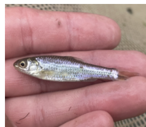
15. Notropis stramineus , Sand Shiner: Slender, compressed body, no hard rays. They have a silvery head and olive back scales with darker linings.