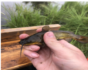
1. Ameiurus melas , *awaazisii Black Bullhead: Large catfish with black barbels near its mouth, a broad head, spiny fins, a square tail, and no scales. Nocturnal and can thrive in low oxygen, turbid waters.