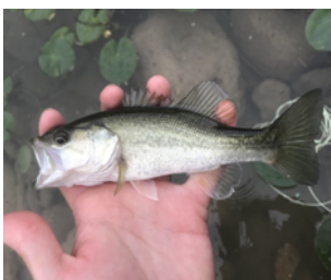
11. Micropterus salmoides , *shigan Largemouth Bass: Olive-green to gray fish with a series of dark blotches forming a jagged horizontal stripe along each side.