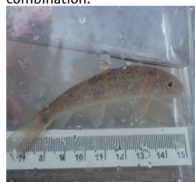
14. Catostomus commersonii , *nmebine White Sucker: Long, round-bodied fish with dark green, gray, copper, brown, or black sides and a light underbelly. It has a sucker mouth with fleshy lips.