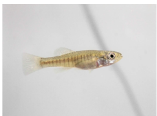
17. Fundulus diaphanus Banded Killifish: Narrow, elongate bluish gray or olive colored body with a darker dorsal surface and a white/yellowish underside. There are vertical bands along the sides—silver in males; black in females.