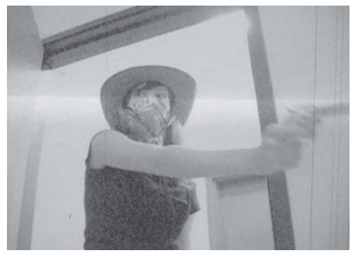
Still images from music videos created by student Elizabeth Oetjens for Slavic 490.