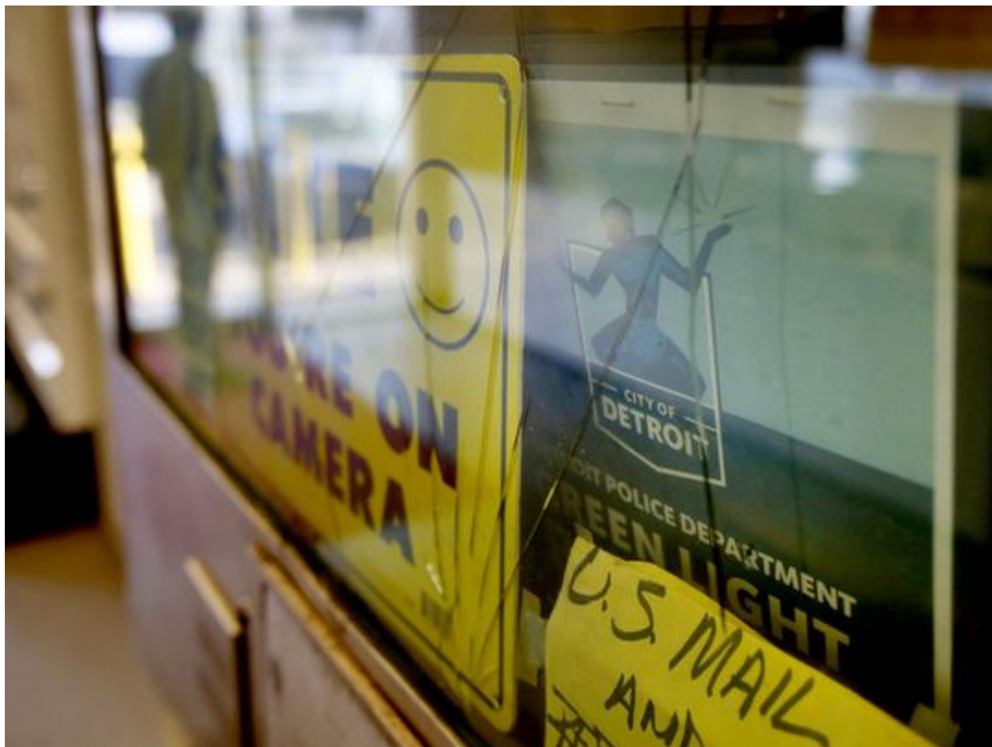
The inside of a laundromat on East 7 Mile Road in Detroit, Michigan, on Thursday, April 19, 2018. This laundromat participates in Detroit Green Light program that has a green strobe light outside the store and cameras inside and out that have a direct video feed to the Detroit Police.