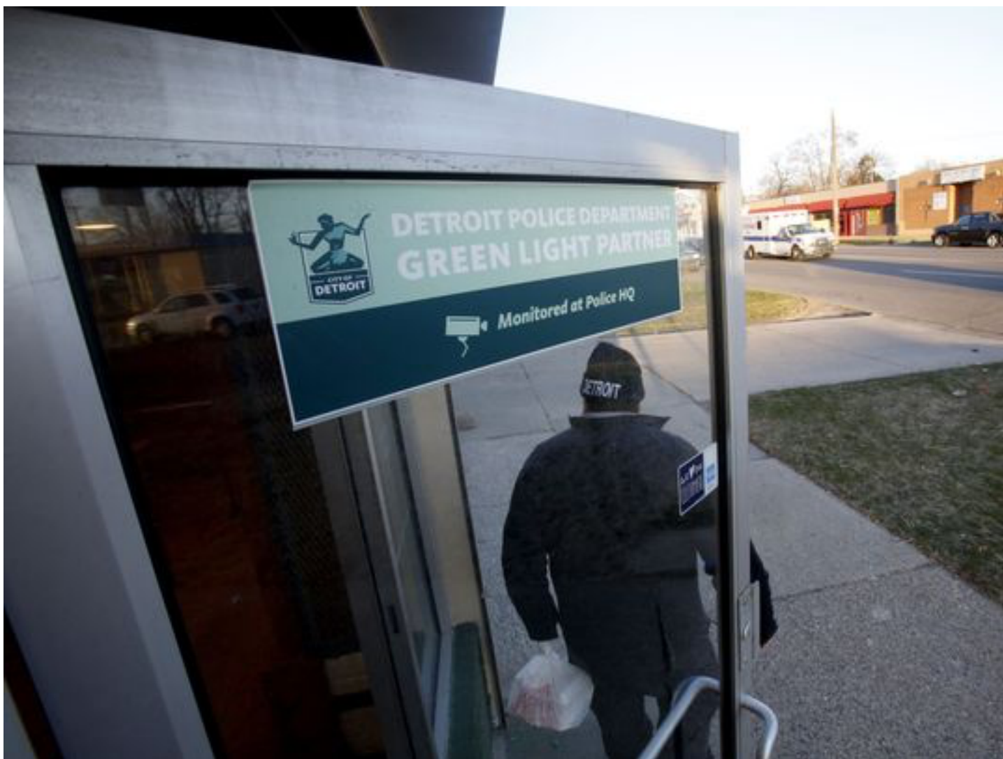
A customer walks out of Southern Smokehouse on West McNichols Road in Detroit, Michigan, on Thursday, April 19, 2018. This carryout BBQ restaurant participates in the Detroit Police Green Light program. This restaurant has four cameras that are connected to the Detroit Police.