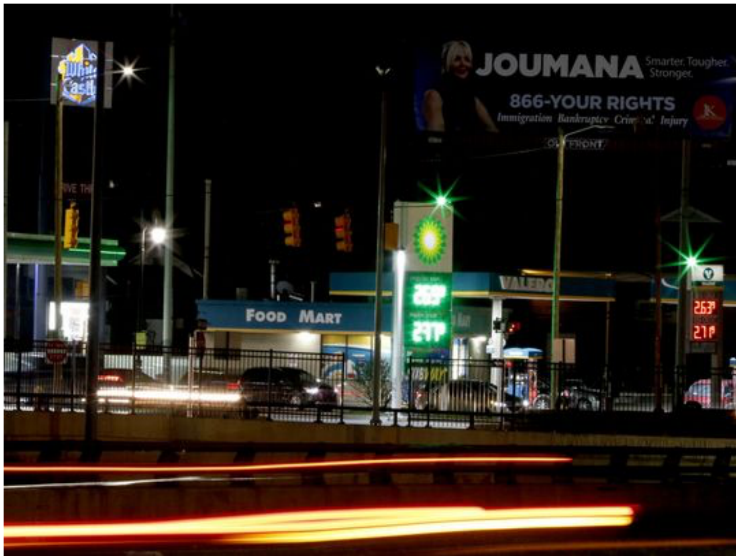
A time exposure showing gas stations that are part of the Green Light program at Grand River Avenue and Southfield Freeway in Detroit on Thursday, April 19, 2018.

In the January interview, in addition to the first-year statistics, Craig pointed to a reduction in carjackings as evidence of the deterrent effect. He cited data from the whole city: A 20% reduction in carjackings from 2016 to 2017.