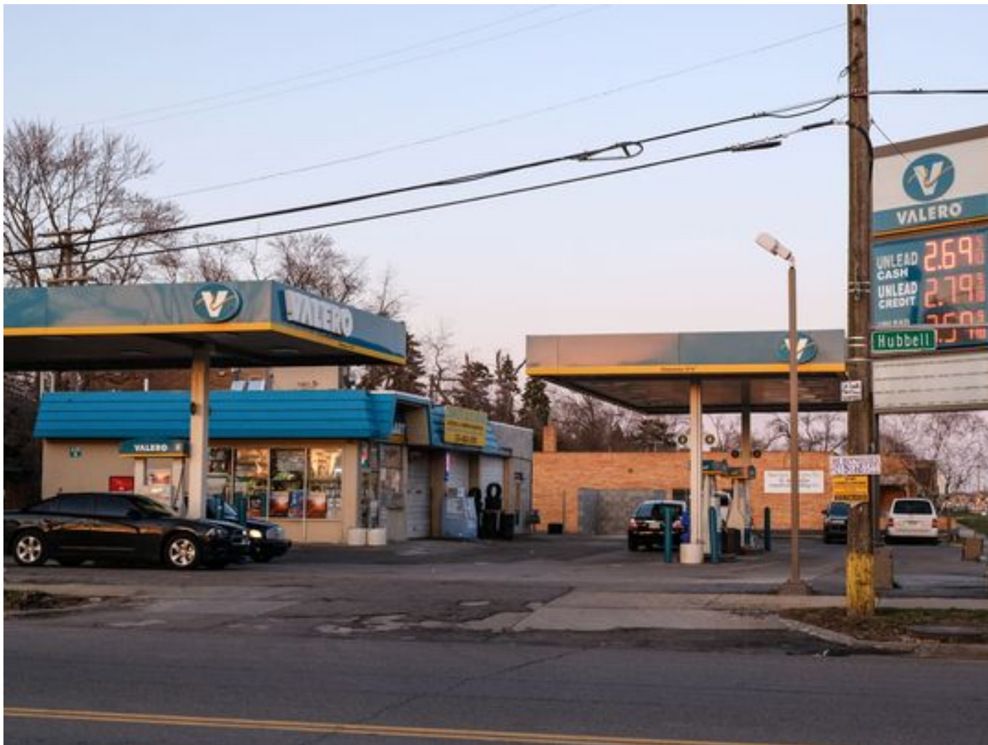
A Valero gas station on W. McNichols in Detroit is seen on Thursday, April 19, 2018. The owner would like to be a part of the Green Light Program with the City of Detroit Police Department.