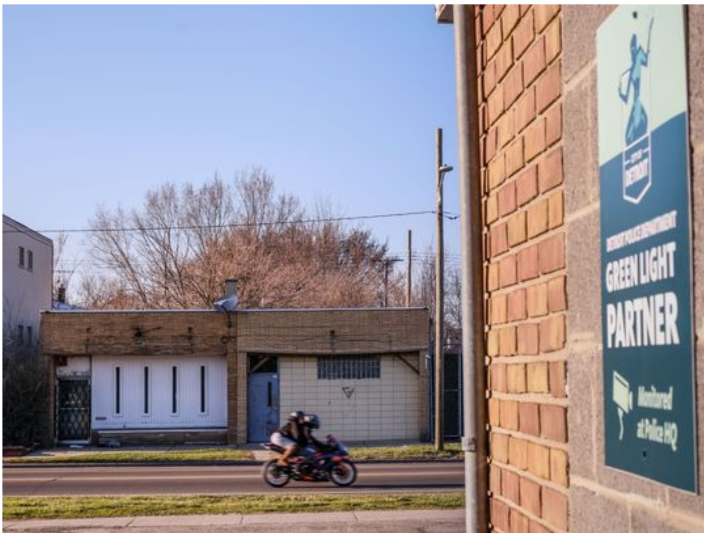
A motorcycle drives past the scene where a homicide occurred outside an after hours bar on Detroit's east side at Westphalia and East 7 Mile earlier this year on Thursday, April 19, 2018, across the street from a laundry mat that is a Green Light Partner with the City of Detroit.