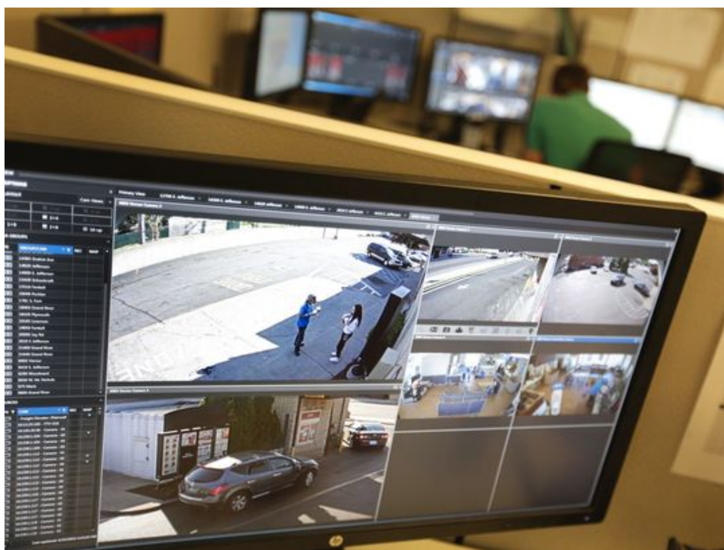
A crime analyst monitors video screens in the real time crime center at the Detroit public safety headquarters in Detroit.

When the Free Press visited the Real Time Crime Center in January, eight people — civilians and sworn police officers — monitored feeds from about 230 partners. According to DPD, at the start of each daily shift — 7 a.m., 3 p.m. and 11 p.m.— each Green Light location is flicked through to make sure the cameras are working. Then cameras are monitored if a 911 call is made, or if the area is considered a hot spot — a rotation of eight to 10 high-crime Green Light locations that get extra attention.