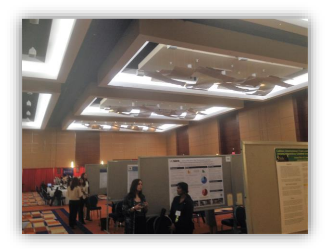
SRA Poster Session