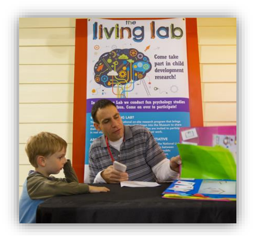
Child participating at the Ann Arbor Hands on Museum