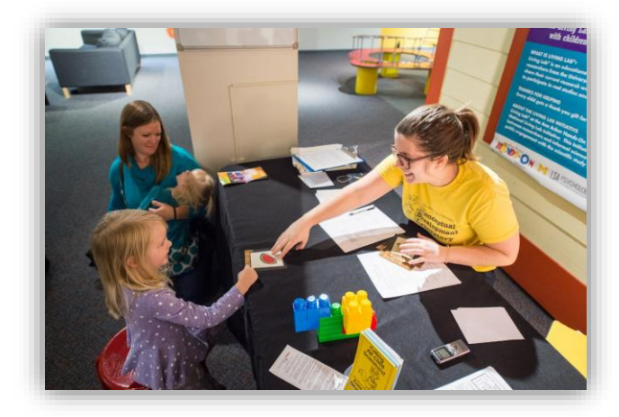
Parent and child participating in a study at the Ann Arbor Hands-On Museum