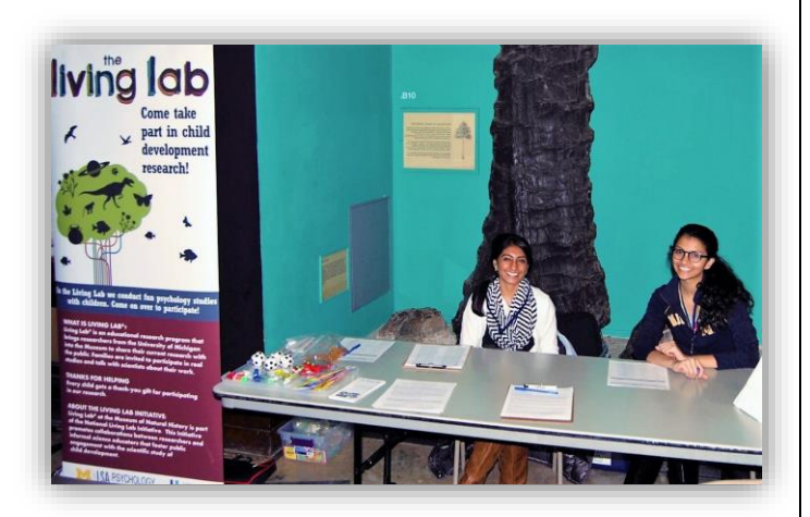
Living Lab research in the lab space at the UM Museum of Natural History