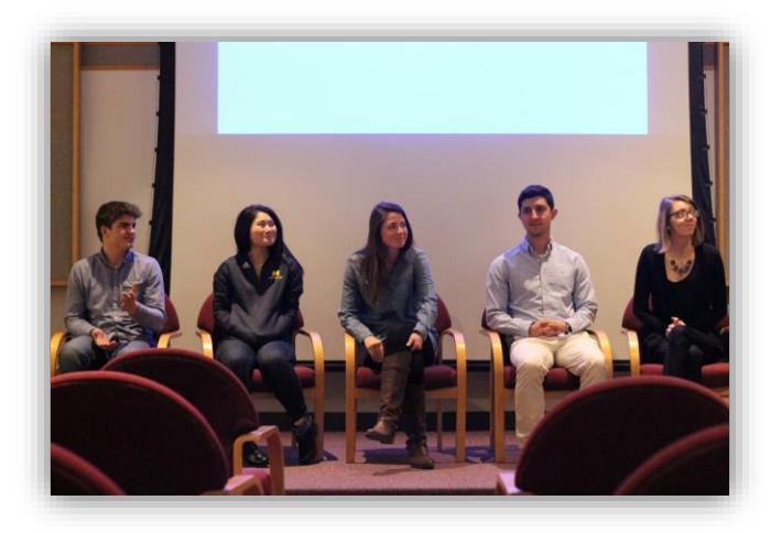
Undergraduate RA panel at the Living Lab Symposium