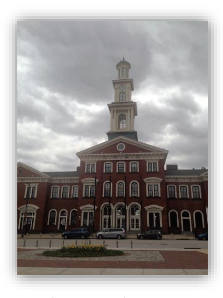
View from the conference center: Geppi's Entertainment Museum