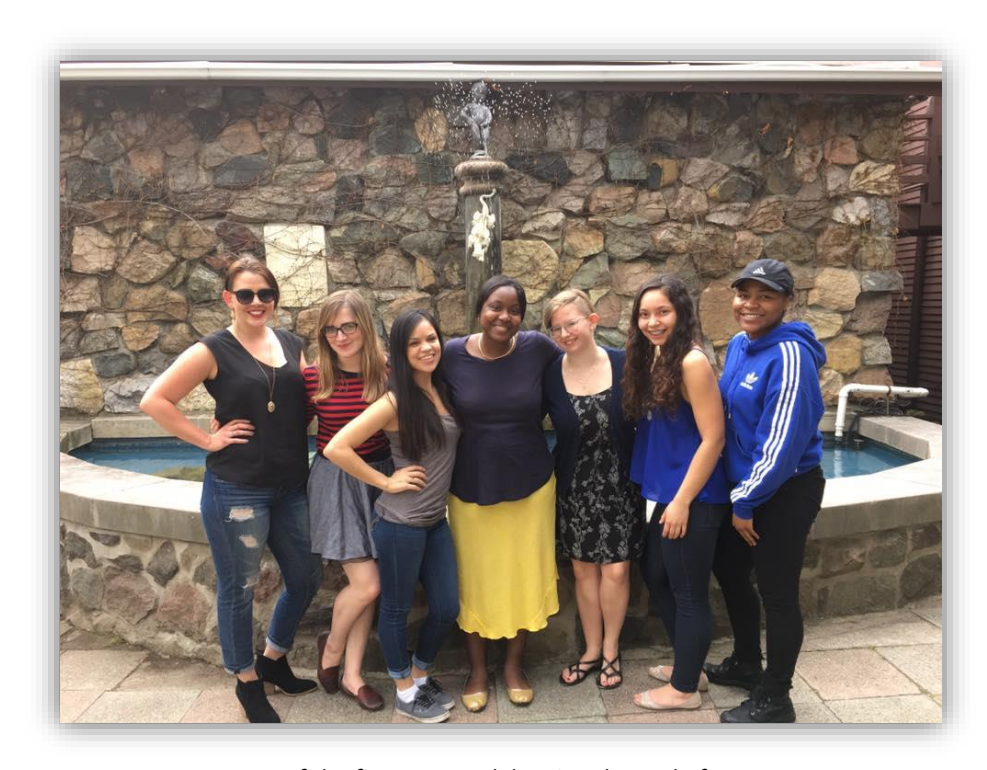
Some of the first years celebrating the end of exams

If you could have any superhuman ability, what would it be? Omnilingualism